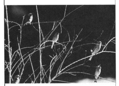
Lawrence's Goldfinches appeared in numbers in western Texas this autumn, their first real invasion in some forty years. This shot taken November 22, 1996, at Hueco Tanks State Park, shows three Lawrence's Goldfinches together (along with two House Finches).

don). There are no previous reports of this sp. in Texas. The T.B.R.C. is currently attempting to obtain more documentation on this amazing record for review.