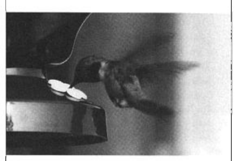
A second for Quebec was this adult male Rufous Hummingbird at Saint-Charles-de-Mandeville October 19, 1996.

October seems to be the only month in which to see N. Rough-winged Swallows in flocks: ≤40 birds fed at Mercier Oct. 5–14 and 30 were at nearby Sainte-Martine Oct. 5 (PB). Late swallows included a Cliff Swallow at Tadoussac Oct. 29 (CG), a Barn Swallow at Montmagny Nov. 9