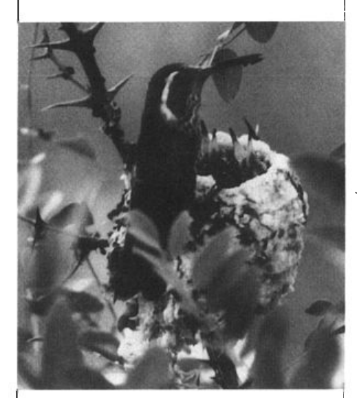
Female White-eared Hummingbird at nest with two young in Carr Canyon, Huachuca Mountains, Arizona, August 10, 1996. Probably only the second confirmed nest for the state.

was n. of this species normal breeding range in Arizona. As usual, at least one ♂ White-eared Hummingbird remained at Ramsey Canyon throughout the period. While a male seen sporadically through the period at Comfort Spring in Carr Canyon suggested again that this species breeds in small numbers in that area, nesting was confirmed July 13 (J. Furusho, ph. C. Nytko), with two young fledging the week of Aug. 11. Full details will be published elsewhere. In June we received 2 different reports, without details, of Berylline Hummingbirds: an apparently banded female in Ramsey Canyon June 5, remaining there about a week, and another female seen in Madera Canyon June 12-23 (fide SGa). Another Berylline was described from the South Fork of Cave Cr. Canyon July 31 (†T&] Heindel). At least two Violet-crowned Hummingbirds were seen sporadically in Madera Canyon; one male was seen off and on from late June-July 27 (MS), while an immature was frequenting the feeders at the Santa Rita Lodge July 15 (CM). Even farther west, an imm. Violet-crowned was reported from Brown Canyon, B.A.N.W.R., June 13-18 (R. Hanson). An imm. Lucifer Hummingbird was described from Brown Canyon June 13, and a female was there June 30 (†R&J Hanson).