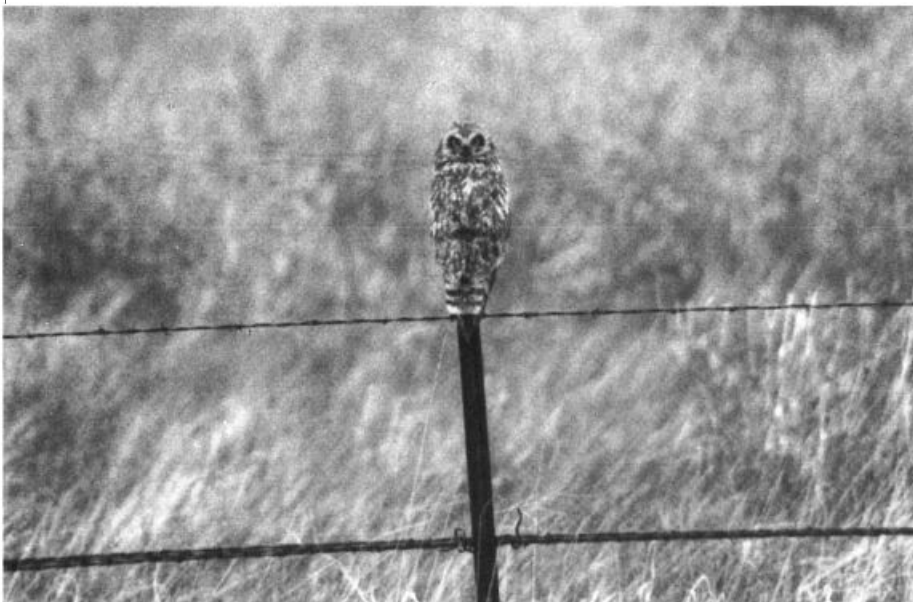
Short-eared Owl on the Pawnee Grassland, Colorado, June 22, 1996.