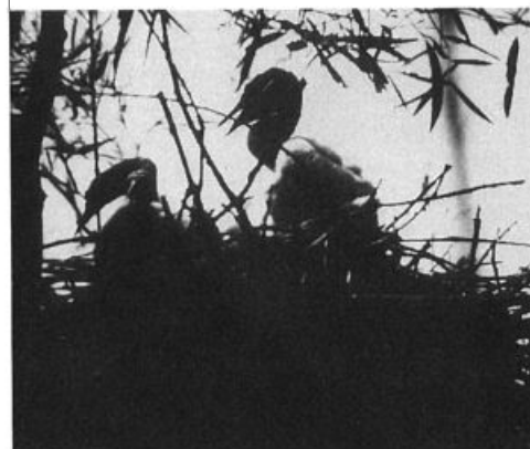
Young Anhingas in a nest in Dyer County, Tennessee, in July 1996.