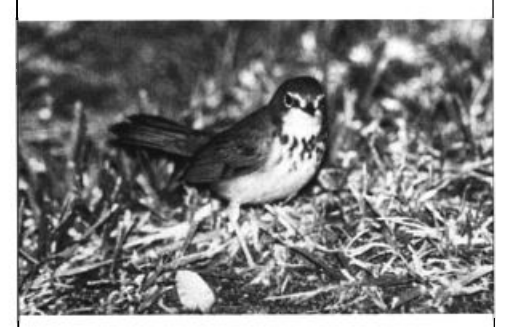
Canada Warbler at Galileo Hill, Kern County, California, June 1, 1996.

certainly well below average. The Prothonotary Warbler found in downtown Los Angeles Feb. 24 was last seen Apr. 24 (RB); a somewhat early vagrant was in San Diego May 3 (ME), a male was banded at Deep Springs, Inyo, May 14 (T&JH), and a 3rd was seen at Pt. Piedras Blancas May 26 (RR). Eleven Ovenbirds scattered throughout the Region between May 17-June 9 was about average, but eight N. Waterthrushes between Apr. 28-May 26 was less than expected. The Kentucky Warbler that spent the winter in S. Laguna Beach remained through Apr. 8 (JBa). A & Hooded Warbler photographed at Corn Springs, Riverside, May 16 (BES) was the only one reported. A Canada Warbler, virtually unrecorded in spring, was photographed at Galileo Hill May 31-June 1 (DVB). A Red-faced Warbler that put in a brief appearance on Pt. Loma in San Diego May 29 (REW, PAG) was only the 2nd to be found on the coast of California in spring.