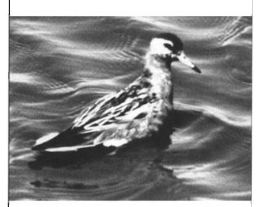
Female Red Phalarope at the sewage ponds on Edwards Air Force Base, California, May 19, 1996.