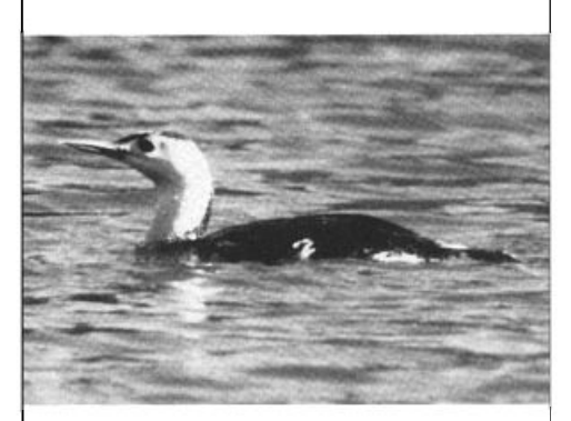
Red-throated Loon in first-summer plumage at the north end of the Salton Sea, California, April 22, 1996.

past Pt. Piedras Blancas, San Luis Obispo, Apr. 26 (RR, no †) was among an estimated 750,000 Pacific Loons migrating past that point this spring (Rowlett monitored the passage of Gray Whales from Pt. Piedras Blancas between mid-March and early June). A Pacific Loon on the New R. near Seeley, Imperial, May 18 (KZK) was inland where rare. An alternate-plumage Yellow-billed Loon reported from Pt. Piedras Blancas Apr 21 (RR, no †) was flying N with other loons. Single Horned Grebes at C.L., May 4-7 (MTH) and on Klondike L. near Big Pine, Inyo, May 15 (T&JH) were migrants moving N through the interior.