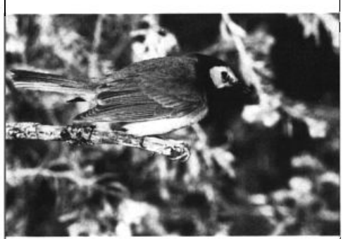
Male Hooded Warbler at Corn Springs, Riverside County, May 16, 1996.

Warbler on San Nicolas I., June 1 (WW) was certainly lost. Single N. Parulas inland at Mojave May 25-28 (SBT) and in nearby California City June 4 (TME), and a 3rd on the coast in Goleta May 23-24 (NS), were far less than normal. The Chestnut-sided Warbler that spent the winter in Santa Barbara was still present Apr. 21 (JHod), and the one in Huntington Beach was still present Apr. 20 (DRW), documenting the approximate time of departure for these birds; the only spring vagrant reported was one in San Pedro, Los Angeles, June 9 (JS). Two Magnolia Warblers at Galileo Hill June 2 (JCW, BB) were the only ones reported. A 3 Black-throated Blue Warbler, most unusual in spring, was at Scotty's Castle at the n. end of Death Valley May 26 (SBT). A Black-throated Green Warbler, also unexpected in spring, was on Pt. Loma in San Diego May 27-29 (REW). A Palm Warbler in Orange, Orange, Apr. 27 (BA) and another in Encino, Los Angeles, Apr. 14 (RB) had both been present all winter; two banded on San Nicolas I., Mar. 18 (WW) and another banded there Mar. 30 (WW) had probably been present all winter; one on the coast near Playa del Rey, Los Angeles, Apr. 16 (RAH) could have wintered locally, but one at Galileo Hill Apr. 27 (DVB) and another at Agua Caliente, San Diego, May 4 (GLR) were clearly migrants at desert oases. Nineteen Black-and-white Warblers scattered throughout the Region was slightly below average, but ten Am. Redstarts was