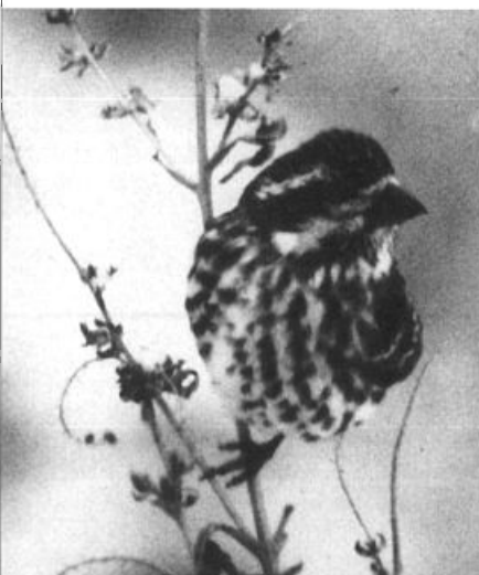
Female-plumaged Purple Finch in Baca County, Colorado, March 24, 1996.

A Canyon Towhee at Cody Mar.1–May 31 (MD), if accepted by the Wyoming Records Committee, would provide the first state record. An out-of-place Rufous-crowned Sparrow was in Boulder , CO May 20–22 (DWK, M&SP). Black-throated Sparrows provided excitement in Estes Park, Larimer , CO May 20 (SR, S&JR, WPL, JFB), and furnished S.L.V.’s 3rd record at Monte Vista Mar. 30 (JJR, LR). Sage Sparrows showed up in 4 locations n.e. of their normal range in Colorado, possibly due to drought conditions. Single birds were at Huerfano Res., Pueblo , Mar. 25 (MJ), in Jefferson Apr. 4 (BS et al. ), at Wellington, Larimer , Apr. 11 (S&KM), and in Douglas Apr. 28 (BB). On Apr. 20, Bridges’ reported an amazing six Baird’s Sparrows at Upper Queens Res.; if true, this could be the largest number reported in Colorado in years. A late and unusual Swamp Sparrow was at Goshow May 18 (†RS, JS, BW). Golden-crowned Sparrows were at Fallon, NV May 3 (GC, LN, RF) and Estes Park May 5–6 (MT). A Harris’ Sparrow was reported from Las Vegas, NV Mar.1–May 5 (MC) and five were in Cody Mar. 1–May 15 (ED, JCi). Bobolinks were reported, with a single male at Jaroso, Costilla , CO May 15 (†LR) providing S.L.V.’s 3rd record, ≤four at Tonopah, NV May 19–25 (DT, JBr), and