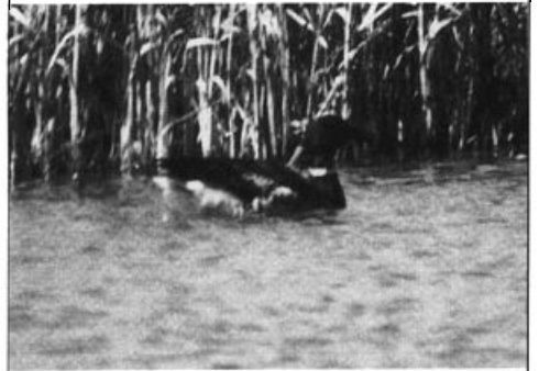
Brant at Ash Meadows National Wildlife Refuge, Nevada, April 7, 1996.

A Brant was at Ash Meadows N.W.R., NV April 7 (JC, MC, ph.) and 17 at Walker L., NV May 24 (NS). A ♂ and ♀ Am. Black Duck were at Hamilton Res., Larimer, CO Apr. 16 (RAR); the origin of this species is always debatable. Colorado's 3rd Garganey was a male at Boulder (same site as the 2nd record) Apr. 23–May 12 (BS, m.ob.). Same individual? Two ♂ Eur. Wigeons were recorded at Sheridan, WY Apr. 10 (†HD, JW et al. ), another two at Casper, WY Mar. 13 (J&VH), one in Iron, UT Mar. 31 (SDS), and one in Weld,