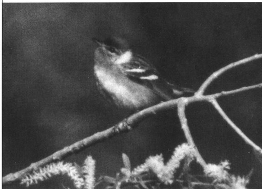
Male Bay-breasted Warbler at Dixon Reservoir, Colorado, May 20, 1996.

A ♀ Hepatic Tanager was seen at Apishpa S.W.A., Las Animas , CO May 21 (MCA). Seven Summer Tanagers were recorded in Colorado and a very rare one near Cody, WY Apr. 27 (ED). This species seems to be expanding its range and nesting may occur soon. Two Scarlet Tanagers were in e. Colorado, at Bonny Res., May