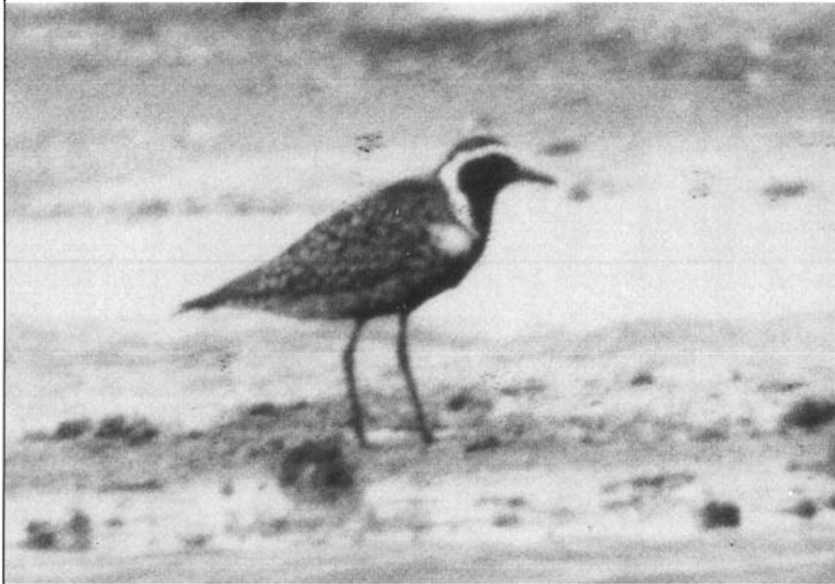
Golden-plover at Big Soda Lake, Nevada, May 17, 1996. Showing white along the sides under the wing, this bird was thought by the observers to be a Pacific Golden-Plover, not just an American Golden-Plover in molt; the status of the two golden-plovers in the interior of the west is still poorly understood.