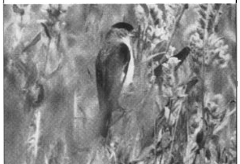
Male Lesser Goldfinch along the Boise River at Boise, Idaho, in late May 1996. This bird appears to be foraging at flower heads of Fiddle-neck, Amsinckia, a favorite source of seeds.