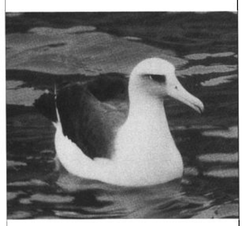
This Laysan Albatross again spent most of the winter just offshore at Point Arena, California, where it was photographed December 9, 1995.