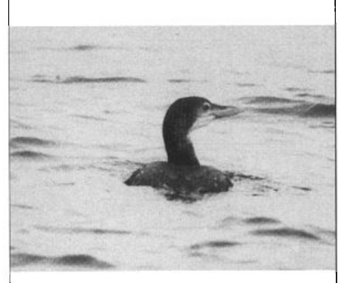
Adult Yellow-billed Loon near Pacific Grove, California, December 29, 1995.

The N. Fulmar irruption was exemplified by 1025 counted flying N past Pillar Pt., San Mateo, Dec. 2 (RSTh). The proportion of white morphs increased in February to about one-third (DR). A