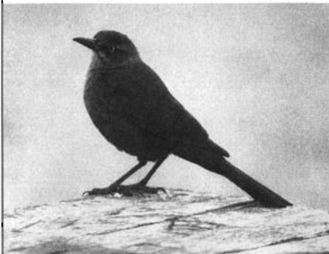
Great-tailed Grackle is continuing to expand its small foothold in the interior of the Northwest. This female was at Marsing, Idaho, through February 1996.

Although regular in Montana, Com. Redpoll are irregular in Idaho. The species made a typical showing in w. Montana this winter, but was more widespread than usual in Idaho, including a single in Lewiston Dec. 9 (C.B.), 16 in Moscow Dec. 12–Jan 4 (KD, m.ob.), 20 near Challis Feb. 4 (AD), and 60 in Deary Feb. 22 (CV). At least one Hoary Redpoll associated with the Moscow redpoll flock Dec. 15–Jan. 1 (†KD, ph. †MD, †DNS, m.ob.), for Idaho's 4th documented sighting.