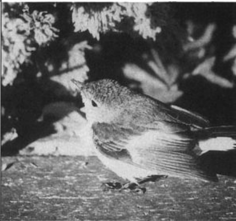
American Redstart (female or immature) at Reno, Nevada, December 19, 1995.