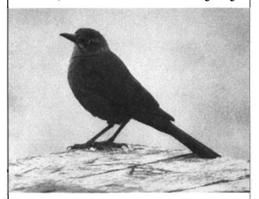
Great-tailed Grackle is continuing to expand its small foothold in the interior of the Northwest. This female was at Marsing, Idaho, through February 1996.