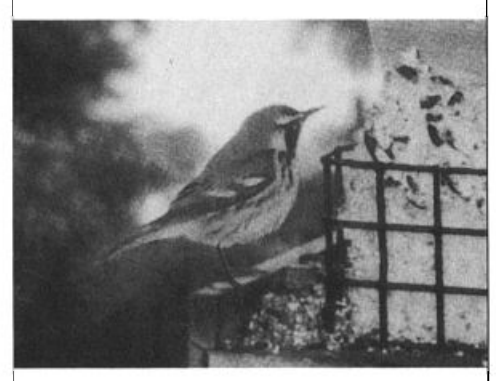
Yellow-throated Warbler at Harrison, Idaho, in December 1995. A first for the state, it visited this feeder from mid-November 1995 into January 1996.