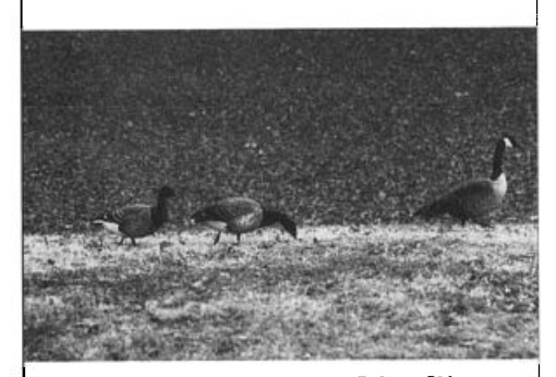
Two Brant on the Ohio River at Belpre, Ohio, across from Parkersburg, West Virginia, on December 5, 1995.