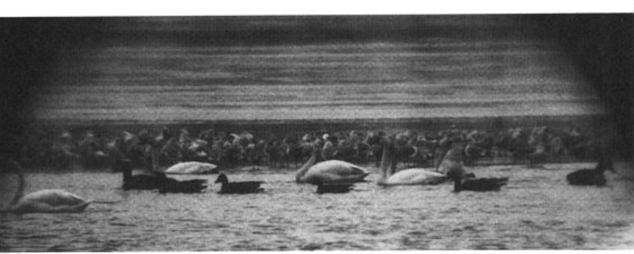
The very small Canada Goose at center (with other Canadas and Tundra Swans), present at Presque Isle State Park, Pennsylvania, December 17, 1995, was thought to represent the race B. c. hutchinsii —a very rare stray to the region.

The Wild Turkey continues to expand range and increase its numbers, as illustrated by 208 on the Indiana, PA CBC (M&RH) and a single flock of 98 at Beaver Run Res., PA (D&KB). Both counts were made in December and there were no comments about status after the heavy snows. A Virginia Rail was found at Bristol, TN Dec. 31 (RK). The 200 Am. Coots at Conneaut L., PA Dec. 2 had