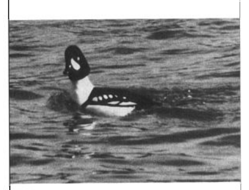
Male Barrow's Goldeneye near Washington Crossing, Bucks County, Pennsylvania, February 12, 1996.

Jersey coasts, but more unusual was a drake at Manitou, Monroe , NY Dec. 2 (RO, RGS) and two-three birds a few mi e. at Sodus Point, Wayne , NY during January.