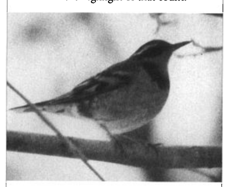
Male Varied Thrush in New Castle County, Delaware, January 9, 1996. First state record.

A few House Wrens lingered into mid-December for CBCs, while Sedge Wrens were found on the Cape May and Cumberland, NJ CBCs, as well as at Oak Beach, Ll, Dec. 17 (KF) and Indian River Dec. 30. A Blue-gray Gnatcatcher was at a traditional spot in Washington Boro, Lancaster, PA Dec. 10, but unlike several previous December birds, this one didn't stay around for the CBC (EW). The Wood Thrush discovered on the Oceanville, NJ CBC was the highlight of that count.