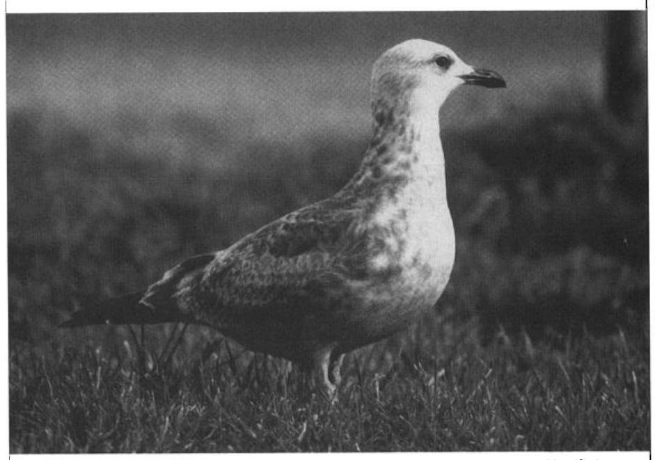
This first-winter gull at the Hackensack Meadowlands, New Jersey, December 12, 1995, was identified as a possible Yellow-legged Gull {Larus cachinnans} from Europe.

White-winged gulls were more abundant that in most recent winter, especially Iceland Gulls, with as many as five in Delaware, five at Safe Harbor on the Lancaster, PA CBC, and a couple dozen in New Jersey. Glaucous Gulls were not so common in the south, but an impressive collection at Greece, NY near Rochester hit a maximum of 32 in early January (v.o.). A first-winter Thayer's Gull was reported from Barnegat Light Jan. 28–29 (B&NM, BMo); there is still no fully documented record of this species (form?)