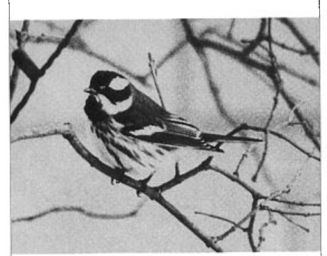
Male Black-throated Gray Warbler in Halifax, Nova Scotia, December 21, 1995. About the eighth record for the province.

sparrows were not common in the Maritimes, perhaps being more scattered on open terrain. Wintering Chipping Sparrows are now regular in Nova Scotia, where there were 25 on CBCs, but four during late December in s.w. Newfoundland were unusual, and only one lingered in New Brunswick. A Field Sparrow was in Herring Cove, NS Dec. 2 (BMa, R. Foxall), and another at a feeder in Shediac, NB, until Dec. 16 (DD). A Vesper Sparrow frequented a feeder at New Glasgow, NS during January (K. McKenna, ph.). Individual Lark Sparrows were on CBCs