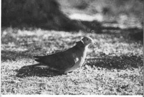
Nova Scotia's (and Atlantic Canada's) third Band-tailed Pigeon was present January 12-14, 1996, at a feeder in Yarmouth.