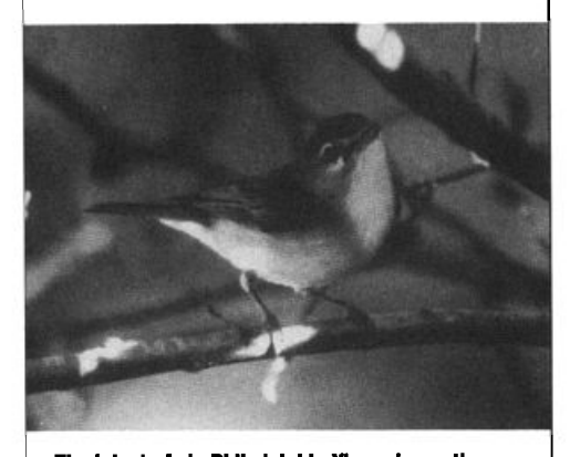
The latest of six Philadelphia Vireos in southern California this season was this bird at Morro Bay State Park November 23, 1995.

Vireo, a rare straggler to California, was in Carpinteria, Santa Barbara, Oct. 6-15 (JEL). A Hutton's Vireo banded near Victorville Aug. 26 (SJM) and another at Galileo Hill Sept. 30 (MTH) had ventured eastward into the high desert, where most unusual. Six Philadelphia Vireos were more than expected, with single birds in Morro Bay S.P., Nov. 23 (EAC), near Oxnard Oct. 14-15 (RB), in Sycamore Canyon Campground near Pt. Mugu Oct. 10 (AS), near Irvine Sept. 30 (RAH), and on Pt. Loma in San Diego Oct. 7-8 (GMcC) & 22 (PAG). Slightly more Red-eyed Vireos than in recent years were also found, with single birds inland near Cantil Sept. 3