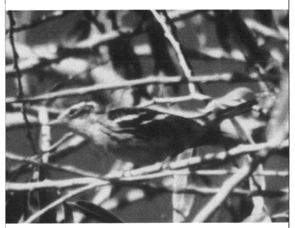
Immature male Blackburnian Warbler at Twentynine Palms, California, November 7, 1995.

Reports of our rare but regular vagrants indicated that average to above-average numbers of most were present, with some found inland as well as along the coast: six Tennessee Warblers along the coast between Sept. 15-Nov. 16, plus one inland at Galileo Hill Sept. 23-28 (CB); five N. Parulas along the coast between Aug. 20-Oct. 21, plus one inland at Cactus City, Riverside, Oct. 1 (DMM); 17 Chestnut-sided Warblers along the coast between Sept. 30-Nov. 4, plus single birds inland near Independence, Inyo, Oct. 22 (A&LK) and at Galileo Hill Sept. 13-20 (KLG), as well as three more along the coast in November that appeared to be wintering; 13 Magnolia Warblers scattered throughout the Region between Sept. 23-Oct. 30; 10 Black-throated Blue Warblers between Sept. 24-Oct. 24, with half of these at oases in the high desert; nine Blackburnian Warblers along the coast between Sept. 17-Oct. 14, plus one photographed inland at Twentynine Palms Nov. 7 (EAC); six Prairie Warblers along the coast between Sept. 23-30, plus one inland near California City Sept. 30-Oct. 1 (RHe); a somewhat lower than expected 35 Palm Warblers along the coast between Sept. 18-Nov. 23, plus an average five inland at oases in the high desert during the same period; a somewhat low 31 Blackpoll Warblers along the coast