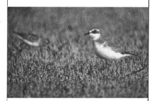
Juvenile Mongolian Plover near Point Mugu, California, September 7, 1995, Sixth state record.

The only migrant Am. Golden-Plovers were single birds near Port Hueneme, Ventura, Sept. 17 (MSanM), at Pt. Mugu, Ventura, Sept. 20 (AS), and near S.C.R.E., Sept. 26-27 (DDJ). A migrant Pacific Golden-Plover was at the Santa Maria R. mouth, Santa Barbara, Aug. 6 (JMC), two were in Goleta Nov. 2 (DDJ), and single birds were on San Elijo Lagoon in Solana Beach, San Diego, Aug. 1-10 (PAG) and Aug. 27 (K&CR); ≤five near Port Hueneme after Aug. 27 (DDJ) and three in Seal Beach, Orange, Aug. 18 (DRW) were at known wintering localities. A juv. Mongolian Plover photographed near Pt. Mugu Sept. 3-6 (DDJ) was the 6th to be found in California. A Mt. Plover at F.C.R., Sept. 24 (MAP) was a little early; single birds near Oxnard, Ventura, Oct. 31 (BL) and near Port Hueneme Nov. 26 (DDJ) were the only two found along the coast, and one at Tinemaha Res., Oct. 25 (T&JH) was at an unusual locality inland.