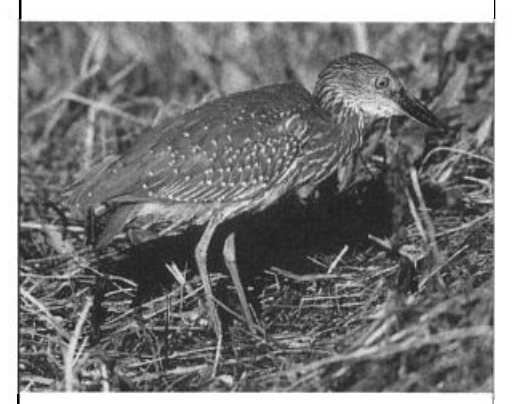
Juvenile Yellow-crowned Night-Heron near Point Mugu, Ventura County, California. September 4, 1995.

An imm. Tricolored Heron at the Tijuana R. estuary near Imperial Beach, San Diego, Nov. 3 (GLR) was the only one reported. A imm. Reddish Egret in Anaheim, Orange, Oct. 10-28 (DLP) was a few miles inland, and an adult at the Tijuana R. estuary Oct. 7-Nov. 26 (TRC, EM) was the same individual with a