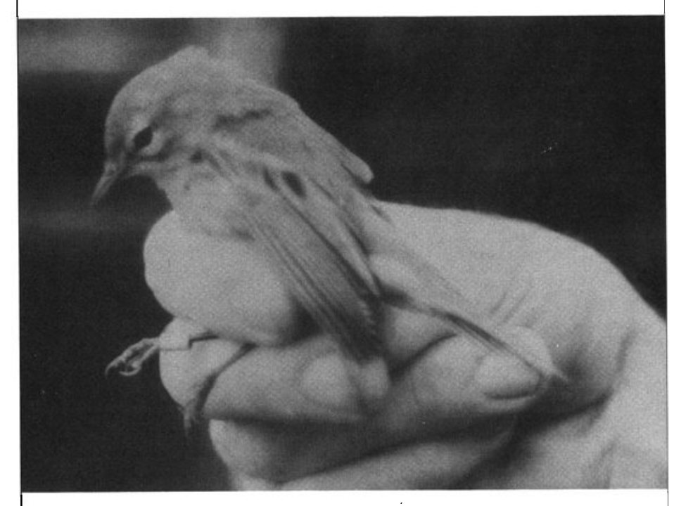
A prize find at the Triangle Island Banding Station, off the northwest tip of Vancouver Island, British Columbia, was this Prairie Warbler September 8, 1995. It provided a second documented record for the region.

In only its first fall season, SA the Sea I. Banding Station, near Van. airport has already produced some surprises. From its startup Aug. 3 until the nets were pulled down in October, 3221 birds of 41 species were captured. Of note were Greater Van.'s first three Magnolia Warblers, and two Clay-colored Sparrows, listed as accidental for the checklist area. It is hard to jibe the "discovery" of the Magnollas with its summer range across the n.e. half of the B.C.; it is more likely that they had been passing through undetected in small numbers, possibly at night. The 489 Lincoln's Sparrows was an eye-opener - I doubt anyone would have picked it to be the most frequently caught species before the project started. Next most numerous were Song Sparrow (463), Whitecrowned Sparrow (369), and Orangecrowned Warbler (355). It was nteresting to note that of the 343 "Gambel's" White-crowned Sparrows captured, 95% were immatures!