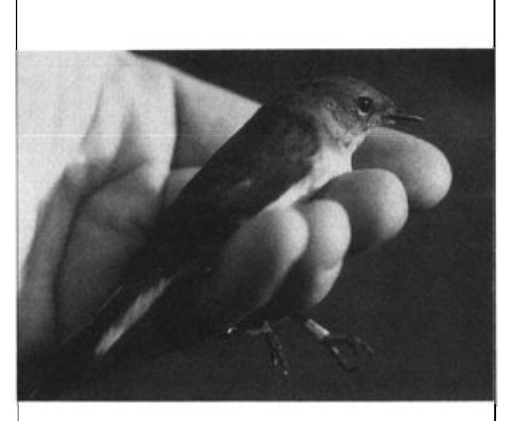
Northwest of its usual limits was this adult female American Redstart captured for banding at Kluane Provincial Park, Yukon, August 26, 1995.