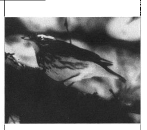
Louisiana Waterthrush at Washington Ranch, Eddy County, New Mexico, n September 3, 1995. The large bill, broad white supercilium, and unmarked throat are all visible in this portrait.