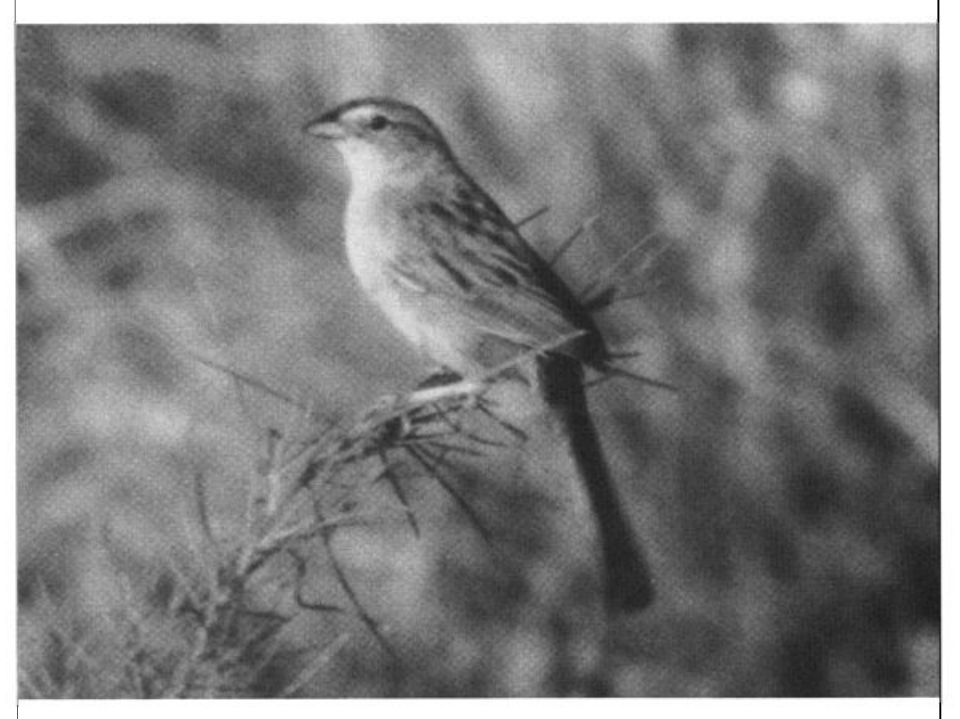
Representing a recently-discovered breeding colony was this adult Botteri's Sparrow in the Animas Valley, New Mexico, August 1, 1995.

A Scarlet Tanager was in n. Roosevelt Oct. 7 (JEP, ph. JO). Blue Grosbeaks were feeding fledged young at 6600 ft near Los Alamos Sept. 13 (PRS). A Lazuli Bunting at San Andres N.W.R., Aug. 31 (WH, fide MW) furnished a local first; Painteds were w. to Mangas Sept. 14 (RF), Socorro Sept. 10 (PB), and La Mesa Aug. 1 (GE). Small numbers of Dickcissels were at 12 sites from the R.G.V. eastward Aug. 21-Oct. 8 (v.o.); westerly were one at Tyrone Sept. 27 (EL) and two at Deming Sept. 16 (BN, DE). At least one juv. Botteri's Sparrow was in the Animas Valley Aug. 1 (SOW), where 14 of 15 territories visited still had resident adults (ph. SOW). American Tree Sparrows w. to Rio Arriba included an early one at Stone L., Nov. 4 (JEP, JO) and 19 at Los Ojos Nov. 24 (CR). Early Field Sparrows were one-two at Boone's Draw Oct. 21 (JEP, ph. JO) and Oasis S.P., Oct. 28 (JO). Late was a Lark Spar-