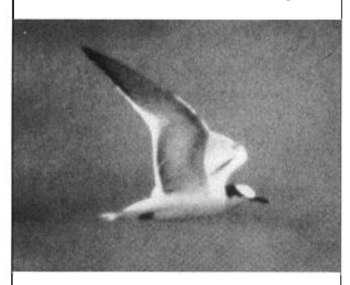
Common Tern at Elephant Butte Lake, New Mexico, September 24, 1995.

A Long-tailed Jaeger at Zuni's Pescado L., Aug. 5 (ph. DC) was a local first. Extremely rare in New Mexico, a firstwinter Laughing Gull was at Brantley L., Aug. 19-27 (ph. JO; JEP, SW, DE, BN). High count for California Gulls was 75 at Stone L., Oct. 14 (JEP); smaller numbers of Californias were at 13 additional sites from San Juan and Colfax s. to Grant and Sierra (v.o.). Sabine's Gulls staged a spectacular showing Sept. 9–Oct. 8, with \geq 22 at 12 sites in 9 counties (v.o.; ph. TR, BZ), including five at La Joya Sept. 23 (JEP, JO) and the only adult at Sumner L., Sept. 22 (JEP, JO). Perhaps unprecedented were reports of one-seven generally welldescribed Com. Terns at 8 sites from the middle R.G.V. eastward Aug. 20-Sept. 30 (v.o.); one-two were northwest at Morgan L., Sept. 29-30 (ph. TR). Two probable Arctic Terns, an adult and a juvenile, were at Maxwell N.W.R., Sept. 28 (JEP, JO); there is but one definite state record. White-winged Doves, now resident in Roswell, were joined there by at least one Eurasian Collared-Dove in September (ph. LM), the latter a New Mexico first. Inca Doves were n. to Roswell (LM) and e. to Tatum (PRS, CR) and continued to increase at Carlsbad (SW); Incas where rarely noted included singles at Deming Nov. 11 (BN) and Arrey Aug. 26 (BZ) and two at Tularosa Sept. 29 (CS). In sharp contrast to other doves, the Common Ground-Dove has practically disappeared from the state; this season produced but one, near Santa Teresa Sept. 24