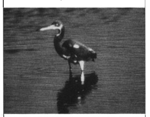
Immature Tricolored Heron at Bitter Lake National Wildlife Refuge, New Mexico, August 12, 1995. Singles appeared at four sites in the southern part of the state this season.