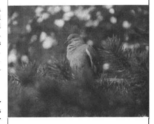
A first for the Prairie Provinces was this White-winged Dove at Thompson, Manitoba, in August 1995.