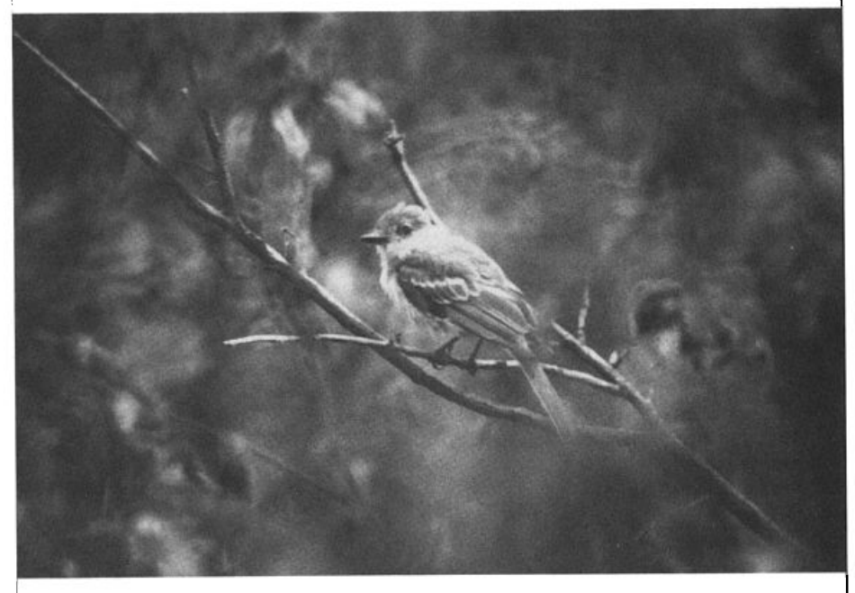
This juvenile Myiarchus flycatcher at Chicago at the beginning of September created excitement and a bit of controversy. It was identified as an Ash-throated Flycatcher, although juveniles are notoriously hard to identify, and most eastern records of Ash-throateds are later in the fall.

A late Alder Flycatcher, identified by call note, was found in Boone , IA Aug. 31 (DT). Accidental in the Region, a bird identified as an imm. Ash-throated Flycatcher at Chicago's McCormick Place Aug. 31–Sep 2 (JO,