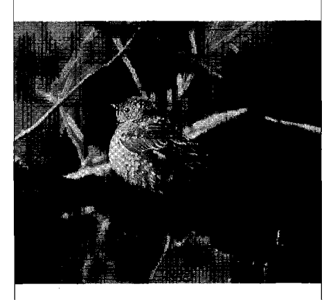
A first confirmed record for Indiana was furnished by this Townsend's Solitaire at Indiana Dunes National Lakeshore November 24, 1995. The bird still shows much of the spotting and scaling of juvenal plumage, surprising so late in the season.