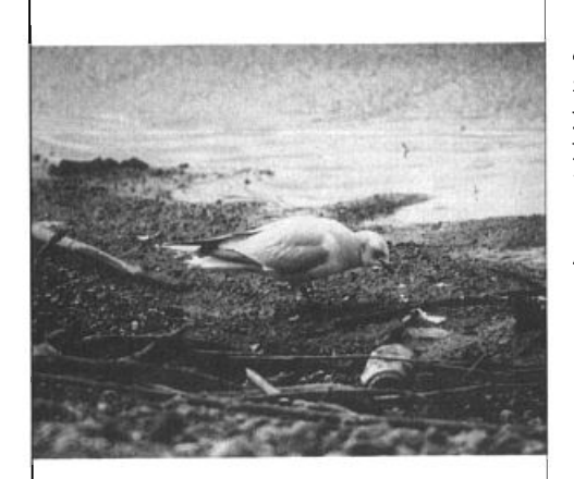
An autumn surprise was this adult Ross' Gull at Eagle Creek Park, Indiana, November 4, 1995. A first for the state, it remained for a week, to be seen by many.