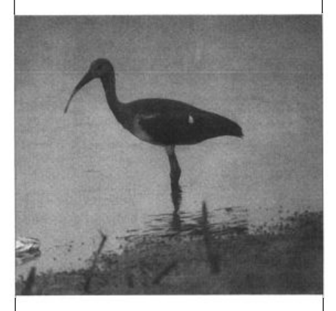
Considered overdue was this immature White Ibis, a first for Iowa, at Coralville Reservoir September 6, 1995.

Although bitterns remained scarce, heron and egret numbers were generally quite encouraging. Noteworthy reports included a late Least Bittern at Illinois Beach S.P., Oct. 7 (ASt), a late Great Egret at Clinton L., IL Nov.18 (RCh, m.ob.), 88 Snowy Egrets in Alexander and Union , IL Sept. 4 (JDu, ST), and 250 Little Blue Herons in Monroe , IL Aug.10 (MDe). In contrast to most herons, Green Herons were scarce, especially in Ohio, where the peak count at Ottawa N.W.R. was only two (EP). An unexpected development was above-normal Yellow-crowned Night-