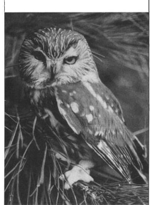
More than one thousand Northern Saw-whet Owls were banded during the season in the Kiptopeke area of Virginia, highlighting a massive invasion noted in several eastern regions. This individual was at Eastern Shore of Virginia National Wildlife Refuge November 15, 1995.