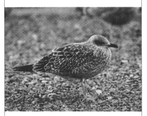
Lesser Black-backed Gull in first-winter plumage at St. John's, Newfoundland, November 25, 1995.

Most curious were small groups of sub-ad. Long-tailed Jaegers resting on the beaches of Sable I., NS June 6-Sept. 2, with an extraordinarily high count of 25 Aug. 2 (ZL). The usual scattering of Laughing Gulls across the Region included singles at The Whistle, G.M.I., Oct. 7 (AS); Mactaquac Dam, NB Nov. 13-20 (DG); Sable I., NS Aug. 17 (ZL); Waterside, NS Sept. 10 (KM et al.), and one late August-Sept. 2 Biscay Bay, NF (KK, TB). An ad. Franklin's Gull was seen from a boat going to Seal I., NS Oct. 7 (IM et al.). Common Black-headed Gulls peaked at 70 during November at St. John's, NF (BMt). An ad. Mew Gull was at St. John's, NF Aug. 23-Nov. 30+ (KK et al.). Lesser Blackbacked Gull totals included seven in New Brunswick, four in Nova Scotia, and 10 in Newfoundland, the latter including five in juvenile plumage feeding with Herring Gulls around a St. John's duck pond in the last week of October. An ad. Sabine's Gull was among a feeding frenzy of birds at Bulkhead Rip, G.M.I., NB Oct. 26 (LM). Black Tern was confirmed breeding for the 3rd consecutive year well e. of the main