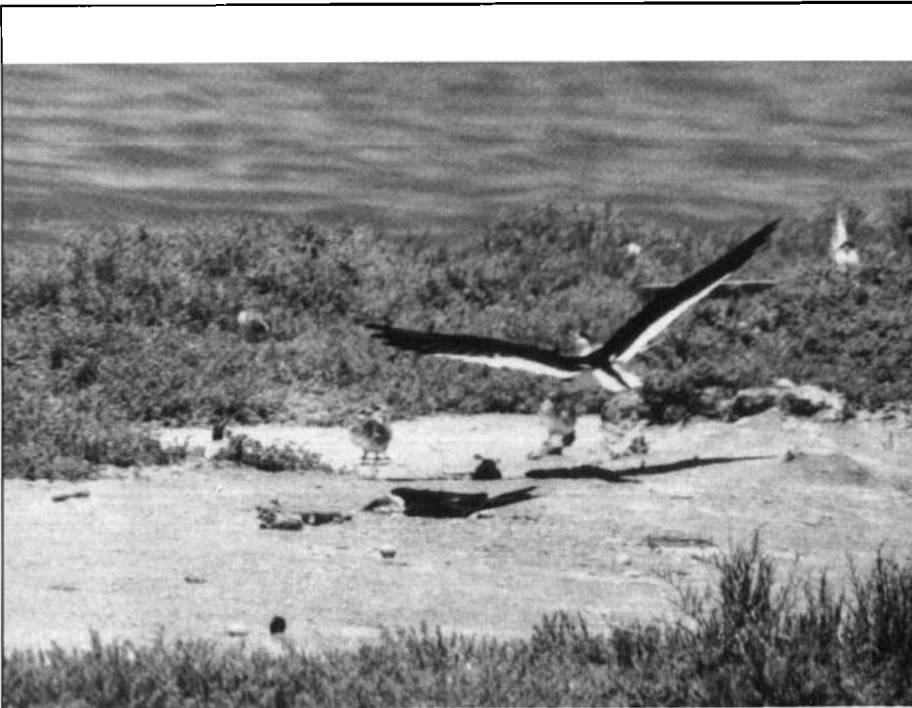
Pair of Black Skimmers at nest with eggs at Mountain View, Santa Clara, California, July 13, 1995.