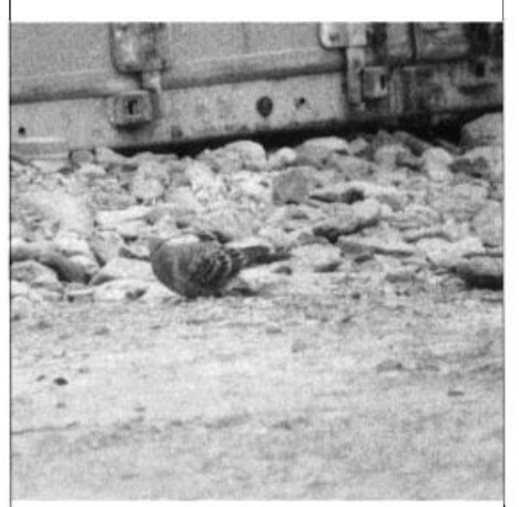
Oriental Turtle-Dove at Dutch Harbor, Alaska, June 10, 1995. This species has been found in western Alaska a number of thmes since the mid-1980s.