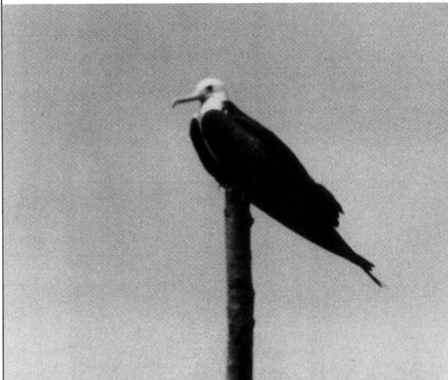
Magnificent Frigatebird is a scarce visitor in North Carolina, and seldom seen perched there. This immature was at Back Sound, Carteret County, June 2, 1995.