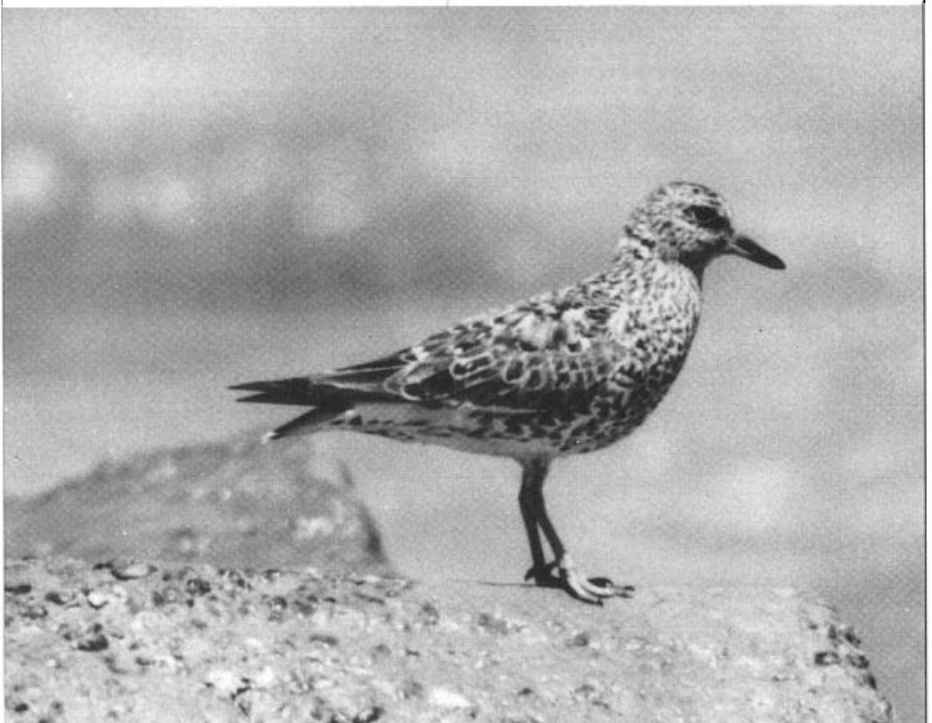
Surfbird at Fulton, Texas, April 13, 1995. One of three reported in the state this season.