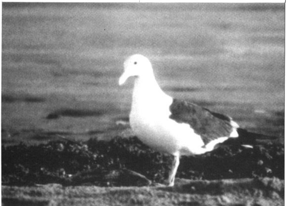
Apparent adult Western Gull at Boca Chica, Texas, April 6, 1995. Texas has only one previous record.