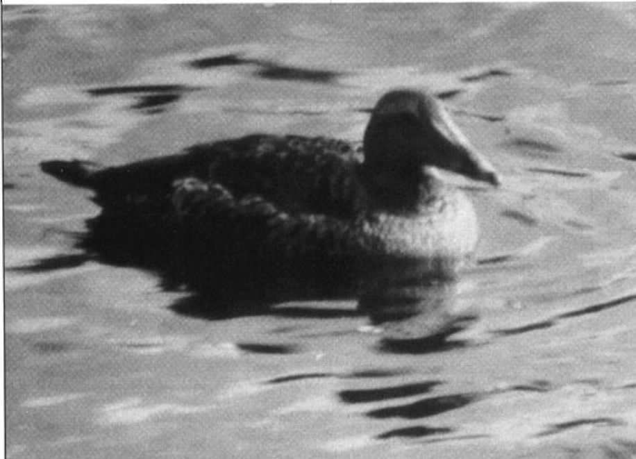
Female Common Eider at Red Rock Reservoir, Iowa, February 28, 1995. This bird, which remained into early April, provided a second state record.

The spring rail flight was unusually strong e. of the Mississippi R. Indeed, it was an excellent year for Yellow Rails in Illinois, where a remarkable seven were reported between Mar. 25–May 2; the peak count was two at Clinton L. Dam Apr. 5 (RCh). The only Yellow Rail reported outside Illinois was at Salamonie Res., IN Apr. 23 (JMc). A Black Rail was reported at Bald Bluff, Henderson , IL May 9 (PP). King Rails were also well represented this spring, with five in Ohio, five in Illinois, and one in Indiana. Some 20 Virginia Rails were reported, typical for the Region. Fine Sora counts included 50 at Arcola, IL Apr. 28 (MD) and 22 along the Indiana lakefront Apr. 29 (JCD et al. ). The only sizable Com. Moorhen count consisted of 21 at L. Cal., May 6 (WM). Otherwise this species remained scarce. One moorhen was discovered at L. Vega, KY May 3 (JK), where the species is rare. As the Region's Sandhill Crane population expands, isolated nesting has com-