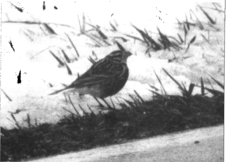
Male Chestnut-collared Longspur in Sioux County, Iowa, April 12, 1995.