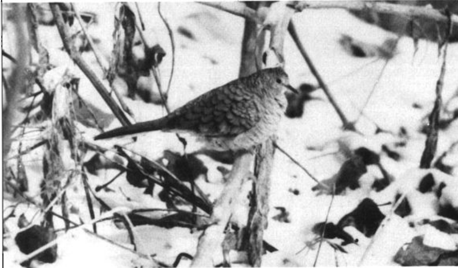
Inca Dove at Rocheport, Boone County, Missouri, March 7, 1995. Second state record.