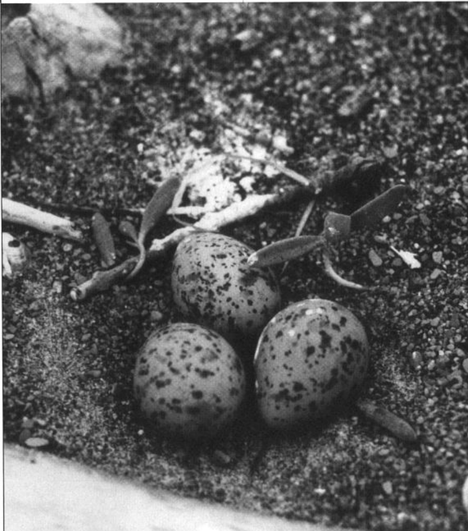
Nest of Common Terns at Presque Isle State Park, Pennsylvania, May 12, 1995. First local nesting since 1966.

The Carolina Wren is fighting back, but while there have been some local increases the overall numbers are still low. A pair at Waynesboro, VA had eggs Mar. 12 (EKb). A