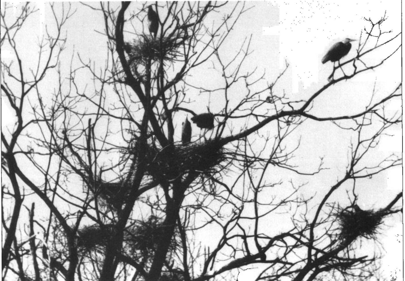
Great Blue Herons at a previously little-known nesting colony in Hawkins County, Tennessee, April 8, 1995.