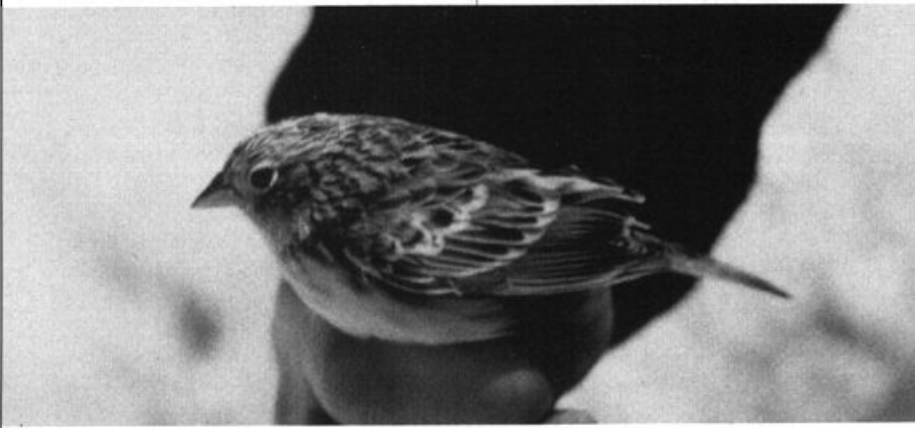
Grasshopper Sparrow at Armendaris Ranch, Sierra County, New Mexico, January 18, 1995. A new winter locale for this species.

The effects of the early season conditions were especially noted in southern Southeast,