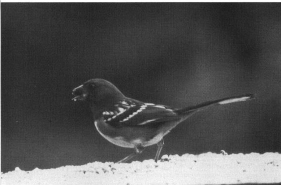
Rufous-sided Towhee in Juneau, Alaska, December 18, 1994.