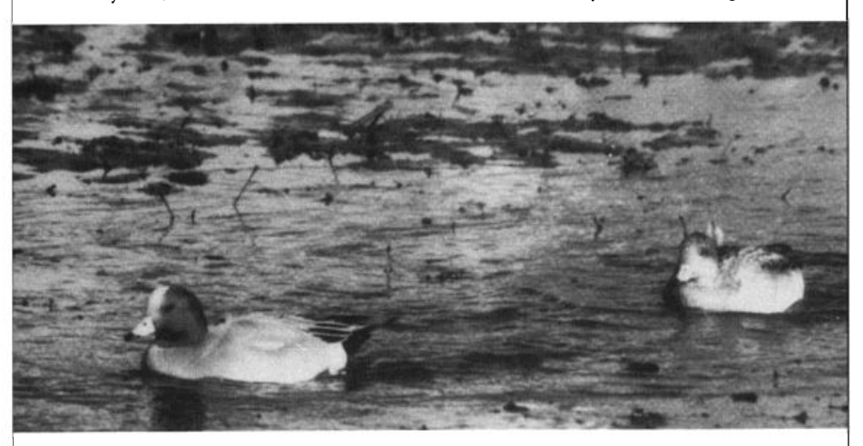
Male Eurasian Wigeon (with female American Wigeon) at Fort Collins, Colorado, December 28, 1994.

Raptors began migrating in late February, with a Turkey Vulture at Gardnerville, NV Feb. 25 (BC) and, the same day, three raptors flying along Denver's Hogback Hawk Watch (single Cooper's and Red-tailed hawks, and a Golden Eagle). January Bald Eagle counts included 196 in n.e. Colorado Jan. 5 (C.D.O.W.), 61 in s.w. Utah Jan. 6 (SH), 85 wintering at L/L/B/L (cf 143 last year), 30 at a roost near Brighton, CO Jan. 28 (TL), a road count of 14 near Rifle, CO (KP), 36 at Prewitt Res., Feb. 4 (DB), and four wintering at Pahranagat N.W.R., NV (MC). The Region reported 74 N. Harriers over the winter, including 9-11 wintering birds at Fish Springs and one-two January birds at Cedar City, Green R., Casper, and