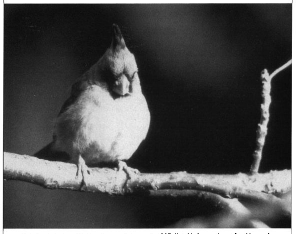
Male Pyrrhuloxia at Wichita, Kansas, February 5, 1995. Notably far northeast for this species.