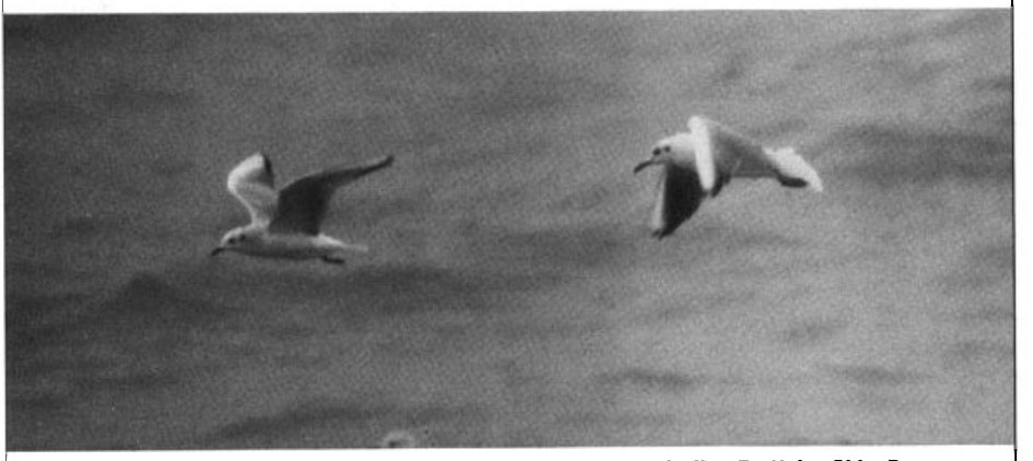
Adult Common Black-headed Gull {right-with flying Bonaparte's Gull} at Eastlake, Ohio, December 17, 1994.

Other shorebird highlights included an Am. Golden-Plover at Maumee, OH Jan. 3 (†MA), four Greater Yellowlegs at Rend L., IL Dec. 29 (LS), three Lesser Yellowlegs at Ottawa N.W.R., OH Jan. 6 (EP, †RHa), a Sanderling (with injured foot) at Evanston, IL Dec. 21 (LB), early December W. Sandpipers in Illinois and Ohio, nine Least Sandpipers in Gibson , IN Jan. 1 (GB), a Pectoral Sandpiper at Ottawa N.W.R., OH Jan. 6 (†RHa), ten Purple Sandpipers on L. Erie, 60 Dunlin at Metzger Marsh, OH Dec. 3 (RHa), and two Long-billed Dowitchers (identified by call) in Sallivan , IN Dec. 31 (†MB, †SJ et al. ).