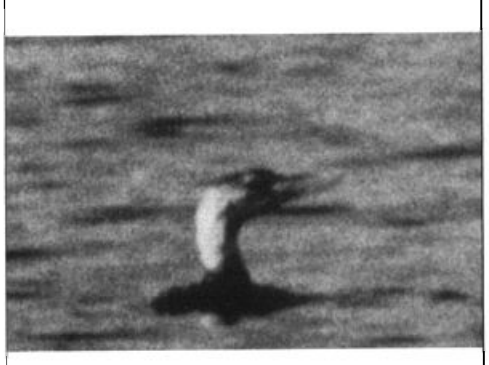
Adding to the growing tally of far inland records, this Yellow-billed Loon was a first for Tennessee at Dale Hollow Lake, Clay County, in February 1995.

Abbreviations: A.B.R.C. ( Alabama Bird Rec ords Committee ); L.B.R.C. (Louisiana Bird Records Committee); p.a. ( pending action ); T.B.R.C. ( Tennessee Bird Records Committee ).