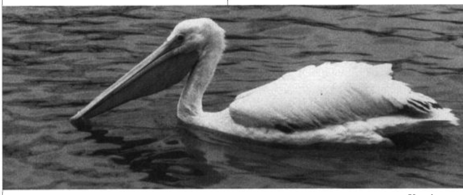
This American White Pelican stayed at Johnson City, Tennessee, from early February into March 1995.

There was not even a suggestion of an influx of "northern invaders," and many of the usual wintering species, such as Song and White-throated sparrows, were scarce. Despite the mild weather there were few of the "half-hardy" stragglers. Most bodies of water remained unfrozen, but apparently most