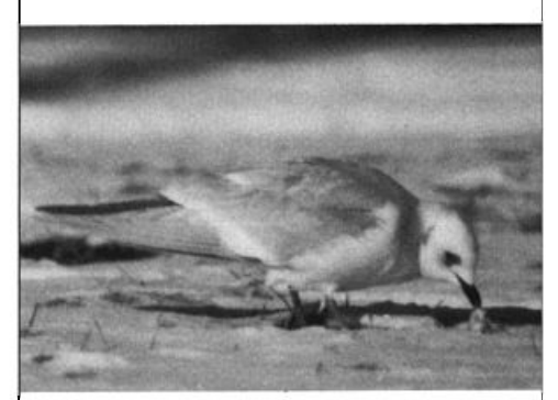
Adult Ross's Gull at Port Weller, Ontario, February 24, 1995. Remarkably, this was the second individual to be found at this location during the season.

L., Jan. 1 (JMH), the latter two excellent counts for inland locations. Lone Blacklegged Kittiwakes were at Port Colborne Jan. 2 (WD) and Hamilton Jan. 14 (RDa), both very late records. Ross' Gull sightings totaled 2 for the period! The first was discovered Dec. 18 at Port Weller, Niagara (RD, KM, BC). A careful search the next day by dozens of frustrated observers revealed a pile of pink feathers surrounded by the tracks of a nocturnal avian predator. The 2nd bird appeared at exactly the same location Feb. 26 (DM, RB, m.ob.) and fared better than its predecessor, remaining until Mar. 1. A Forster's Tern at Pelee Dec. 3 (DM, RB) was record late there.