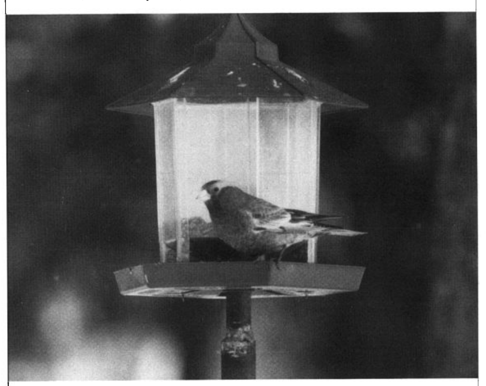
One of two Gray-crowned Rosy-Finches in Ontario this season was this bird at Sapawe during January and February 1995.