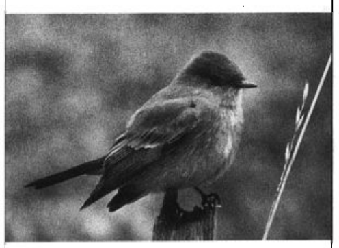
Lingering from fall was this Say's Phoebe photographed December 27, 1994, at Cressy Point, Ontario.

Two different White-eyed Vireos were at Pelee: one Dec. 4 (G&DL), and the other Dec. 1–Jan.1 (RKu, v.o.), which set a recordlate date for the province. A Solitary Vireo at Turkey Pt., Dec. 17 (GGi) furnished one of the few winter records of this species for the province. Late warblers included an Orange-crowned near St. Williams Dec. 17 (AW, MJ); a Nashville at Pelee Dec. 2 (WS, JD); single Cape Mays at King City Dec. 2 (THo, CH), Rondeau Dec. 4 (KB, JB), and Sault Ste. Marie Dec. 10 (TW, v.o.); a Yellow-