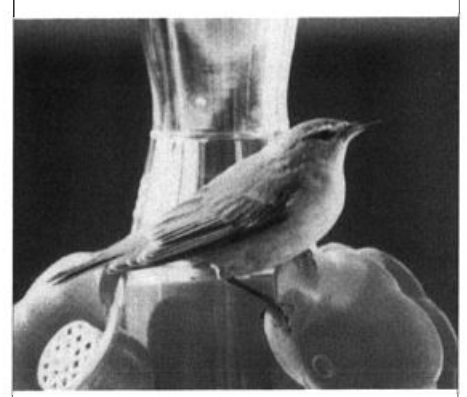
About the third documented winter record for Georgia was provided by this male Tennessee Warbler in Walton County January 8, 1995.