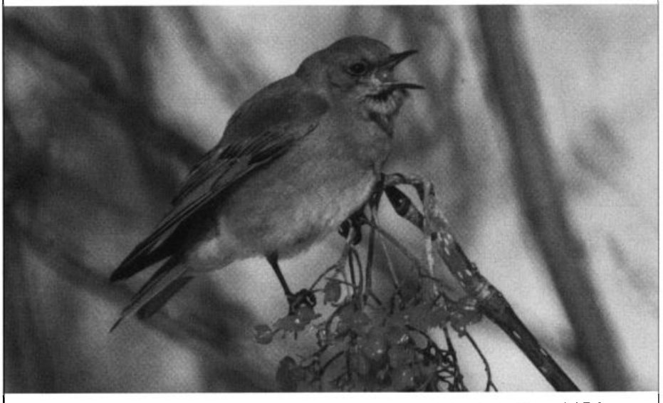
A fourth for Quebec was this male Mountain Bluebird, feasting on berries at Mistassini February 22, 1995.