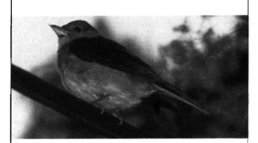
Scarlet Tanager (male in winter plumage) at Malaga Cove, Palos Verdes Peninsula, California, in Nov. 1994.