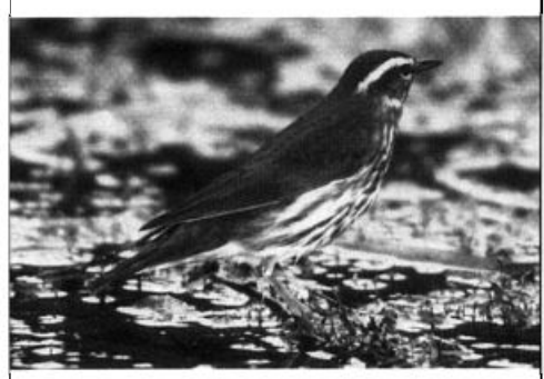
Louisiana Waterthrush at Galileo Hill, California, Sept. 18, 1994. Sixth state record.

followed by seven more scattered throughout the Region between Sept. 17-Oct. 31, and another probably attempting to winter in El Centro, Imperial, Nov. 16+ (KK). More than 20 N. Waterthrushes were found at various locations within the Region, with most during September, as expected. A Louisiana Waterthrush well photographed at Galileo Hill Sept. 16-18 (JTH) was only the 6th to be found in California. A Kentucky Warbler was at Galileo Hill Sept. 22-23 (MTH); nearly 100 are now recorded in California. Unexpected were single Mourning Warblers at Galileo Hill Sept. 15-18 (JLD, MTH) and near Trona, San Bernardino, Sept. 17 (MAP) since there are only 2 other fall records for California away from the immediate coast. A Hooded Warbler in Huntington Beach Aug. 13-Sept. 13 (LRH) was suspected to have summered locally, and another was at F.C.R., Sept. 30-Nov. 12 (BED). Four Canada Warblers