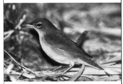
Immature Mourning Warbler at Galileo Hill, California, Sept. 18, 1994.

were found, with single birds along the coast near Lompoc, Santa Barbara, Oct. 9 (BH), near San Pedro, Los Angeles, Oct. 15-16 (MH, KL), and in Irvine Oct. 22-23 (DRW), and the 4th inland near Cantil Oct. 2 (MTH). A migrant Painted Redstart was seen in Yucca Valley, San Bernardino, Oct. 1 (JEP); one in Arroyo Grande Oct. 1+ (8KS) returned for its 2nd winter, and another in Costa Mesa, Orange, Sept. 25+ (JEP) returned for its 3rd winter.