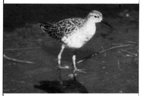
Ruff at Port Hueneme, California, Nov. 12, 1994.

but included a juvenile at F.C.R., Sept.. 17-22 (PAG). A Pectoral Sandpiper near Lakeview Aug. 5 (C-TL) is one of a very few adults to be found in S. California in fall. The only Stilt Sandpipers found away from S.E.S.S. were single birds on the coast at Pt. Mugu, Ventura, Aug. 24 (BS), in Irvine Aug. 13-14 (TEW) and Sept. 12 (NBB), and inland at E.A.F.B., Sept. 5-10 (MTH). The Ruff at S.E.S.S. remained through Sept. 10 (GMcC) and four more were found along the coast, including a juvenile near Morro Bay Sept. 30 (DS), another near Santa Maria Sept. 25 (BH), a 3rd at Pt. Mugu Sept. 3 (MSM) and an adult near Port Hueneme, Ventura, Nov. 12 (DDJ). A few Red Phalaropes are found inland every fall; four this year included single birds near Cantil, Kern, Oct. 2-10 (MTH), California City, Kern, Sept. 12 (DSC) and Oct. 8 (DVB), and at E.A.F.B., Sept. 25 (MTH).