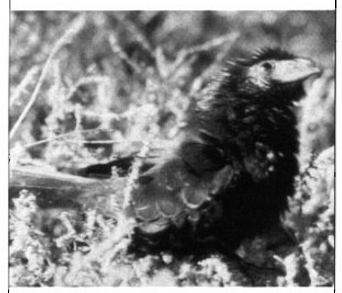
Groove-billed Ani at Bosque del Apache National Wildlife Refuge, New Mexico, Nov. 18, 1994.