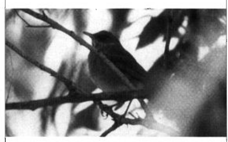
Rufous-backed Robin in Dona Ana County, New Mexico, Oct. 16, 1994. Fifth state record, all in the Rio Grande Valley and all since 1986.