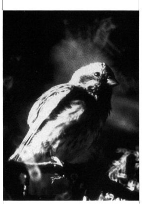
Purple Finch at Conchas Lake State Park, New Mexico, Oct. 22, 1994. The species is a scarce visitor in the state.