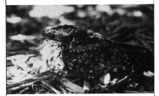
At a migrant-trap oasis in downtown Tulsa, Oklahoma, this Common Poorwill paused Oct. 11, 1994.

Many of secrets of the fall distribution of hummingbirds are now being disclosed by feeder watchers. A & Calliope Hummingbird was captured by a dog around June 23 in Sioux, NE (fide WRS), for only the 4th Nebraska record. Ruby-throateds were reported w. to Finney, KS Aug. 18—Oct. 19 (several; T&SS zt