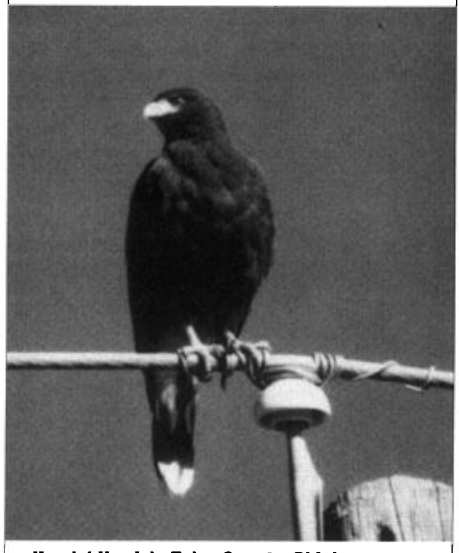
Harris' Hawk in Tulsa County, Oklahoma, Nov. 6, 1994. This southwestern hawk was reported at 4 different sites in the Region this season.