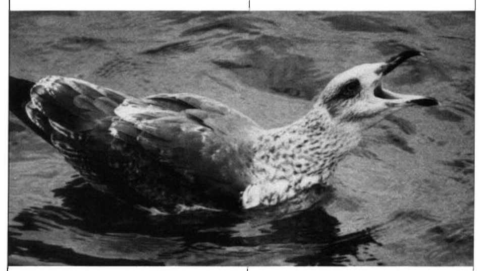
Above and below: Two views of a gull at Chicoutimi, Quebec, Sept. 24, 1994, thought to be a Slaty-backed Gull near the end of its molt into second-winter plumage. If confirmed, it would represent a 2nd record for Quebec.