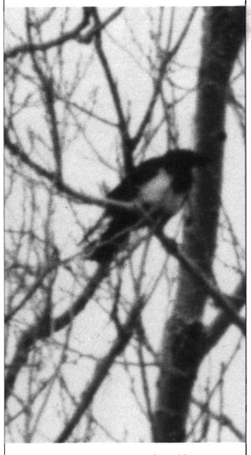
A startling sight was this Pied Crow [Corvus albus], an African species, at Matane, Quebec, in late September and October.