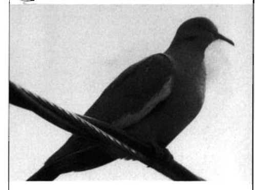
White-winged Dove at Authier-Nord Aug. 2, 1994. Second documented record for Quebec.