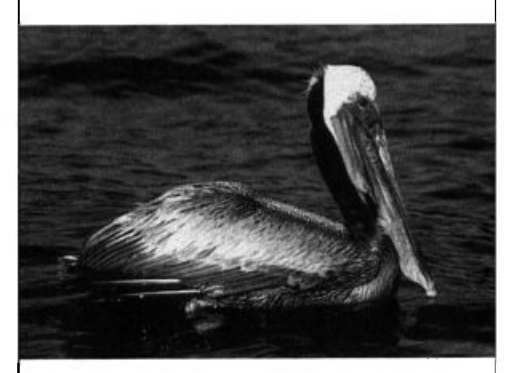
A long series of sightings of single Brown Pelicans along the lower St. Lawrence River this fall may have involved only a single bird, or perhaps two. This photo was taken at Grandes Bergeronnes, Quebec, on Sept. 9, 1994.