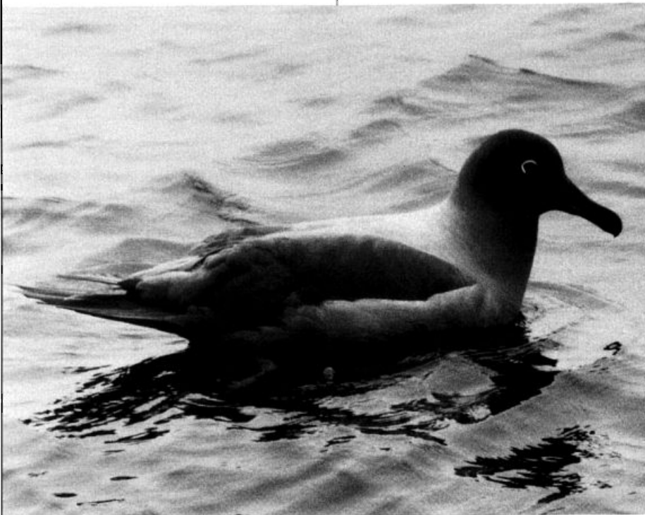
No doubt the most outrageous record of the season (or of many seasons) was provided by this Light-mantled Sooty Albatross at the Cordell Bank off Marin County, California, July 17, 1994. Widespread in southern oceans, this species evidently had never been recorded before in the Northern Hemisphere.