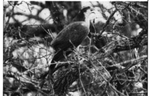
Adult Northern Goshawk in Gillett, Karnes County, Texas, March 16, 1994. Only the sixth documented record for the state.