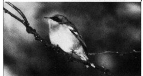
Male Tropical Parula at Rio Grande Village, Big Bend National Park, Texas, May 1, 1994. Regular in southern Texas, the species never had been documented in the western part of the state.