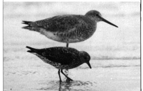
Providing a fifth record for Texas was this Surfbird (front, with Willet) on North Padre Island April 16, 1994.