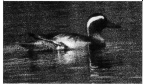
Male Garganey at Presidio, Texas, April 29, 1994. Second state record.

These photographs, submitted with the spring report, were accidentally omitted from the Fall 1994 issue of NAS Field Notes.