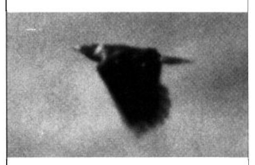
Lewis' Woodpecker in flight east of Hettinger, North Dakota, July 14, 1994. First record for the state in over two decades.

Woodpecker was calling in Bottineau , ND June 5; there are no breeding records for the Turtle Mts.