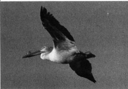
American White Pelican at Hillman Marsh, Ontario, June 2, 1994. Fifth record for the Point Pelee area.