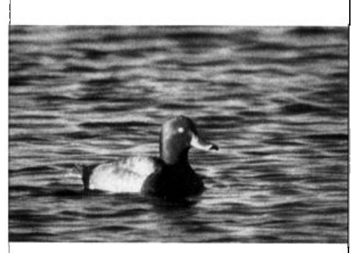
Only a second for the province was this \delta Redhead at Three Mile Rock, Newfoundland, June 20, 1994.

Golden-plovers, presumably Greater Golden-Plover left over from the massive spring influx to Newfoundland, included singles June 8 at L'Anseaux-Meadows (fide DA) and June 12 at Miquelon, S.P.M. (RE). The new breeding outpost of Piping Plovers on the Isthmus, S.P.M. held on for another year with 2 pairs, one with four justhatched young, July 5 (RE, DL).