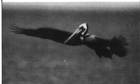
Far from normal haunts was this adult Brown Pelican which appeared in May on Lake Erie. This photo was taken June 2, 1994, over the harbor at Port Dover, Ontario.