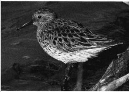
An apparent hybrid Dunlin x White-rumped Sandpiper at Hillman Marsh, Ontario, May 19, 1994. Details of this previously unknown hybrid will be published elsewhere.

Noteworthy spring sightings included a W. Sandpiper at Hillman Marsh May 13–16 (JD et al. ), single Baird's Sandpipers at Norwich May 7–12 (JMH et al. ) and L.P.B.O.'s first-ever spring sighting May 21 (RB), a Buff-breasted Sandpiper at Leamington May 13 (MM), and a Long-billed Dowitcher at Nonquon, Durham Apr. 30 (RP, JI). Observers were puzzled by a very different bird at Hillman Marsh May 18–20 (KM, ph. AW, m.ob.) which was finally believed to be a hybrid Dunlin x White-rumped Sandpiper. Always rare but seemingly annual sightings of Curlew Sandpipers involved one at Harrow May 8–10 & 13–14, one May 11 at Cottam (KK, EJ, m.ob.), and one at Grand Bend May 11–20 (JS, v.o.) joined there by a second bird May 15–17 (AM, v.o.). Sightings of Ruffs included: a black male at Smithville