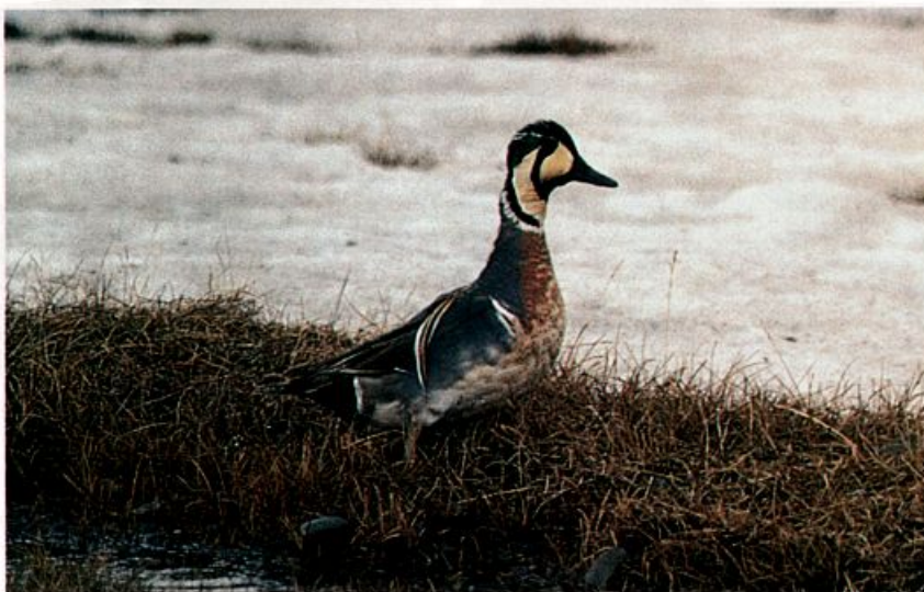
Baikal Teal is declining in its native range in Asia, and recent North American records have been very few. This male (photographed July 6, 1993) spent five weeks at Prudhoe Bay, Alaska, establishing only the third record for the North Slope.