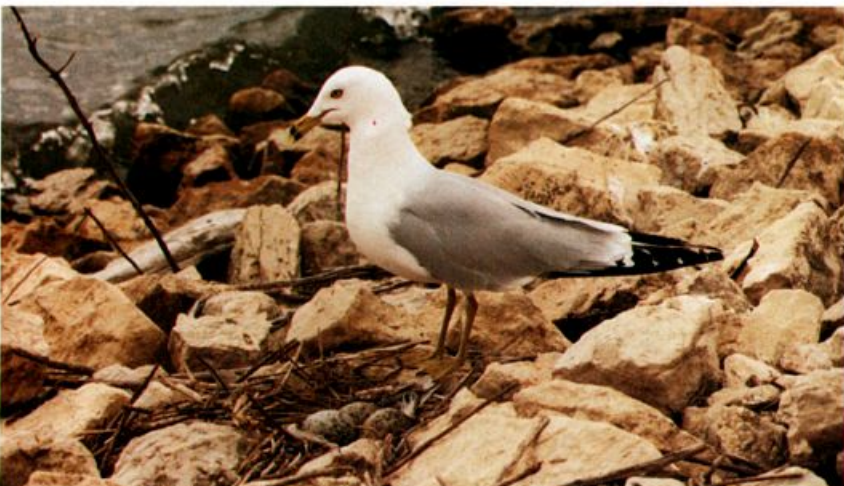
Ring-billed Gull populations in the vicinity of the Great Lakes continue to expand. Nesting was documented at new sites in Illinois, including Grundy County, where this adult was photographed at its nest April 23, 1993.