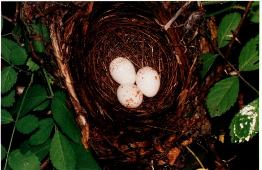
The nesting range of Hooded Warbler is gradually extending northward. This nest found June 30, 1993, represented the first known breeding for Will County, Illinois.