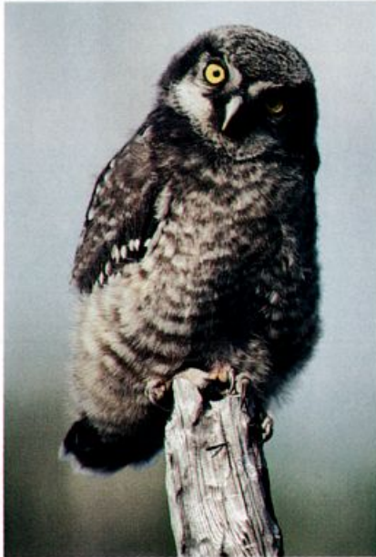
A high population of meadow voles contributed to a good season for owls in Newfoundland. This juvenile Northern Hawk Owl was one of five that had just fledged from a nest near Deer Lake, Newfoundland, on July 31, 1993.