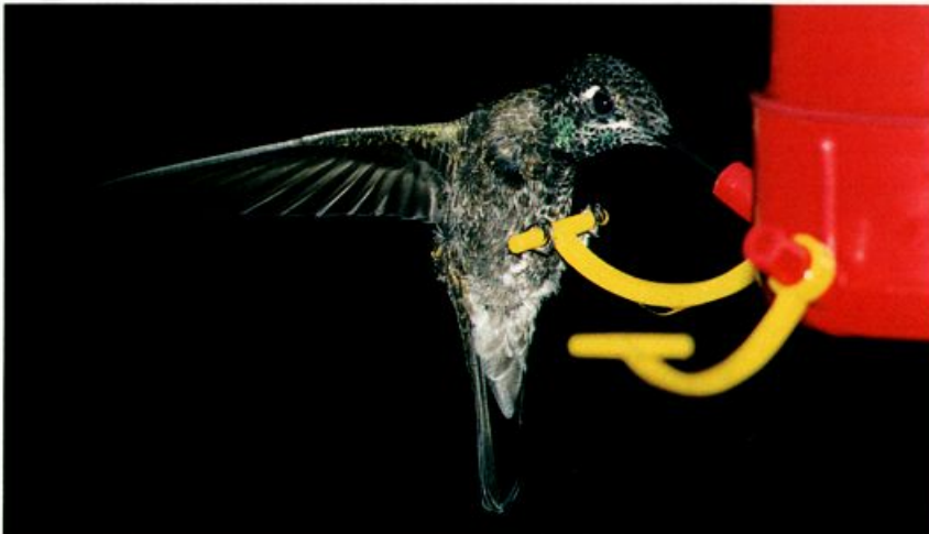
In the Davis Mountains of western Texas, a feeder that hosted multiple White-eared Hummingbirds also attracted a remarkable 15 Magnificent Hummingbirds, including this young male, on July 1, 1993.