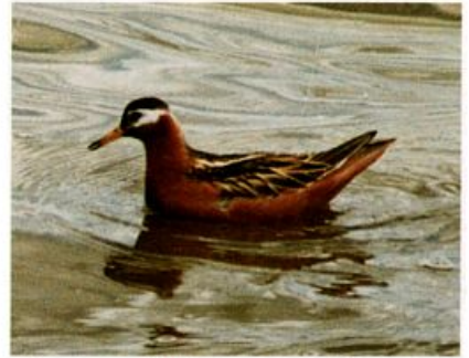
Adult female Red Phalarope at Grand Forks, North Dakota, June 3, 1993. Seventh state record.