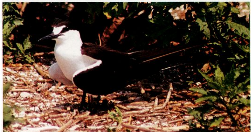
Sooty Tern is a scarce visitor in South Carolina. This adult was on Bird Key, near Charleston, on July 1, 1993.