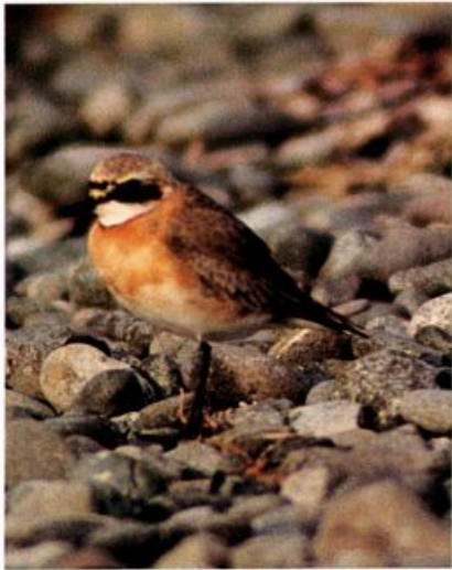
Mongolian Plover at Esquimalt Lagoon, Vancouver Island, on July 28, 1993. Second record for British Columbia.