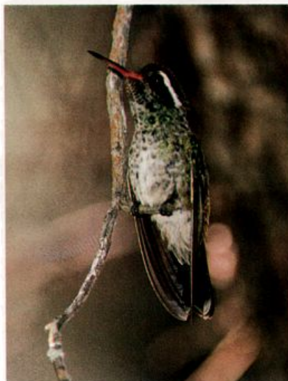
White-eared Hummingbirds made news in New Mexico, Arizona, and Texas this season. This bird was one of two (or more) visiting a feeder north of Silver City, New Mexico, on July 27, 1993.