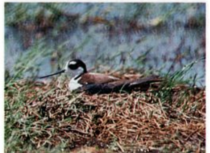
One shorebird that seems to be doing well is Black-necked Stilt. No fewer than four different states noted their first nesting records for the species during the season. This adult female was sitting on a nest in Garfield County, Oklahoma, on July 8, 1993.