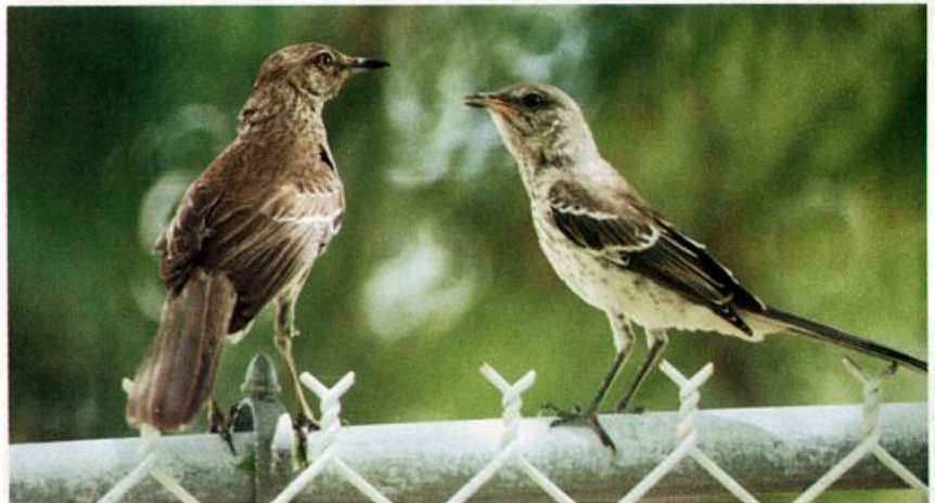
Adult Bahama Mockingbird feeding a young mockingbird at Key West, Florida, on June 17, 1993. The fledgling was thought by some to be a Northern Mockingbird, but its field marks in this photo do not rule out the possibility of a Northern x Bahama hybrid. Photograph/Steve Metz.