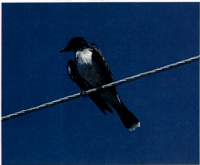
Eastern Kingbirds in Arizona occur mainly in the northern part of the state. This one was a rare visitor near the Mexican border at San Bernardino Ranch on June 27, 1993.