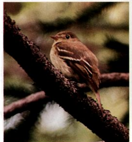
Yellow-bellied Flycatchers were confirmed nesting this season in the vicinity of Prince George, British Columbia, a new westward extension. This adult (in faded plumage of mid-summer) was photographed near the nest site on July 20, 1993.