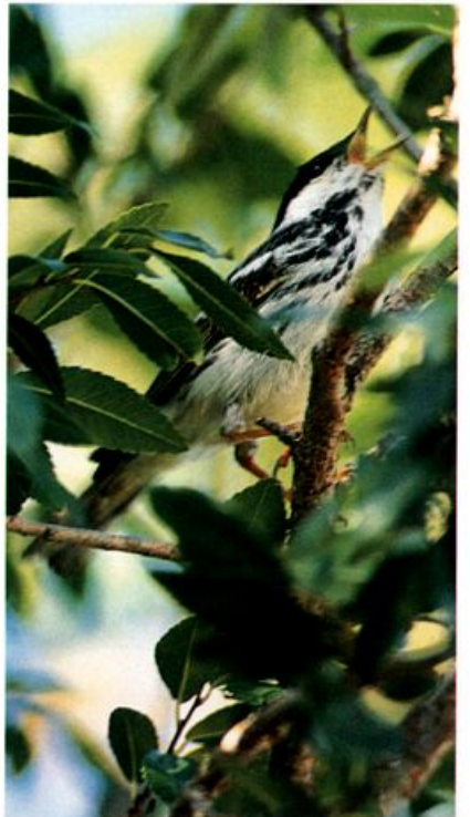
Blackpoll Warblers occur regularly on the California coast in fall, but a singing male inland at Davis on June 18, 1993, was exceptional.