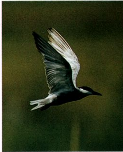
The first Whiskered Tern for North America provided a highlight for observers in New Jersey and then in Delaware during July and August 1993. This portrait was taken at Pickering Beach, Delaware, on August 13, 1993.