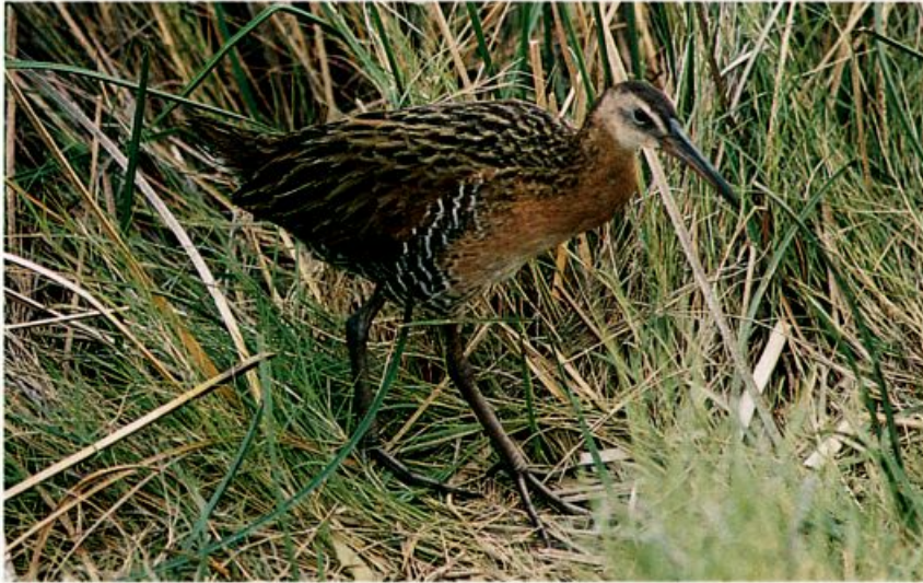
Quite surprising was the occurrence of several rails of the King/Clapper type at Lake Balmorhea in western Texas on July 2, 1993. The birds appeared to be King Rails, but separation of King from various reddish Mexican and western forms of Clapper is still poorly understood.