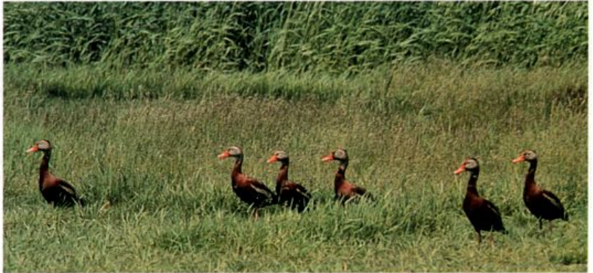
Part of the group of nine Black-bellied Whistling-Ducks that appeared June 17, 1993, at Blezard Valley, Ontario, providing a first record for the province.