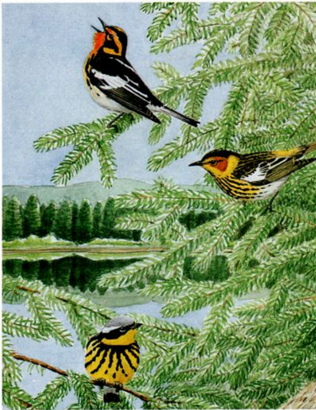
Poster detail: Blackburnian, Cape May, and Magnolia warblers