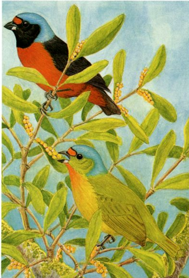
Blue-hooded Euphonias (male and female)