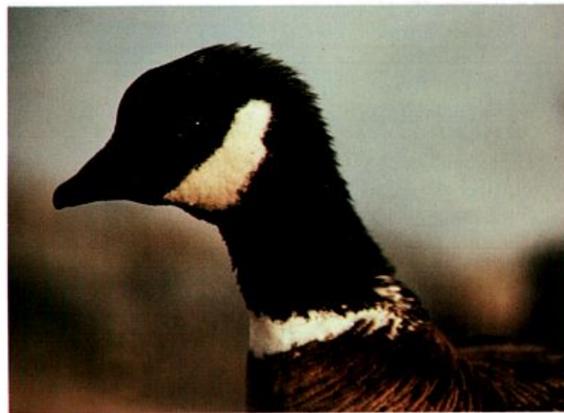
(Aleutian) Canada Goose

The gulls breed in large numbers at the end of runways. Some conservationists fought the shooting, arguing that there are other equally effective methods—such as scaring birds or planting tall grass to discourage nesting near the airport. Supporters of the measure say it has effectively reduced the number of gull