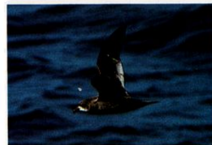
The bull-necked, front-heavy appearance of this Murphy's Petrel is typical of the flight profile of the species.