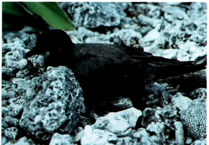
In this adult Murphy's Petrel note the glossy steel-blue coloration, that the back is paler than the wings and head, and that the back feathers have narrow dark fringes. This individual has an intermediate amount of white mottling on the throat, but almost none on the forehead.

The air space immediately over the island was crowded with petrels, gaining speed and altitude with a series of rapid-fire shallow wingbeats, then spiking in high arcs (with the birds oriented vertically or perpendicular to the ground) before tailing down in a long glide on set wings. On