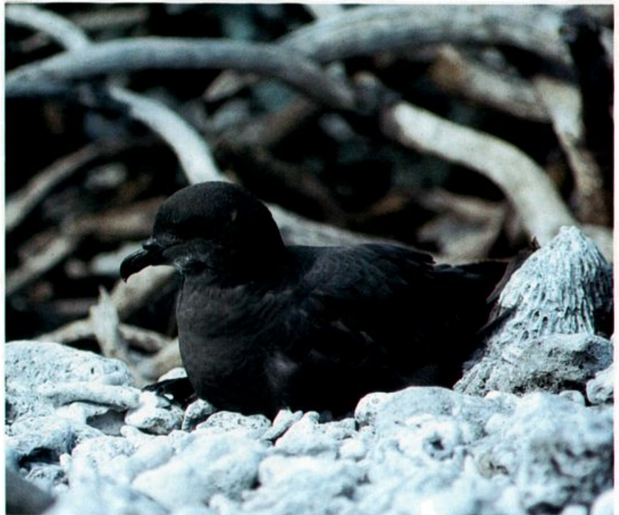
Under harsher light, this adult individual appears less glossy and more brownish than bird below. Note also the general lack of white on the throat and forehead.

During our morning on the island, I did not observe any feeding of young petrels by adults. Parental care consisted solely of close attendance of chicks by single parents. On numerous occasions a low pass over the trees by a Great Frigatebird ( Fregata minor ) would result in the potential pirate being aerially harassed by one