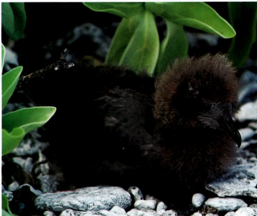
Murphy's Petrel chick on Ducie Atoll on November 13, 1989, the first confirmed nesting of Murphy's Petrel.

November 6, 1989 —One Murphy's and one Kermadec Petrel were observed at sea west of Rapa, associating with a large mixed-species aggregation that included Wedge-tailed Shearwater ( Puffinus pacificus ), Christmas Shearwater ( Puffinus nativitatis ), Brown