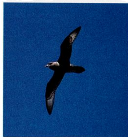
This individual exhibits a dark-hooded look, a result of the glossiness of the plumage, combined with transient light conditions.

mottled whitish throats due to exposure of feathers which are basally white with thin sooty edges. The extent of the white or mottling on the throat varies considerably among birds, some individuals appearing to have almost solid white throats and others being nearly dark. Individuals with more extensively mottled throats typically show white intruding into the malar region. There is also considerable variation in the amount of white or mottling in the lores and above the bill, possibly resulting from differential wear. These feathers are basally dark with narrow whitish margins and should become darker with wear (Murphy 1949). Many birds have dark foreheads and lores, others are irregularly mottled with white in those areas, and still others are extensively white. The latter individuals appear to have a complete white band encircling the bill, a feature that can be obvious on flying birds at reasonably close distances. In spite of individual variation, the most extensively white area on a Murphy's Petrel is always the throat, a character first pointed out by Bailey et al. (1989). All individuals seem to have a dark smudge immediately anterior and posterior to the eye, a character that in the field can only be discerned at very close range. Below, Murphy's Petrels are evenly dark gray, although under some light conditions they may impart a dark-hooded look with a zone of contrast at the breast. Ac-