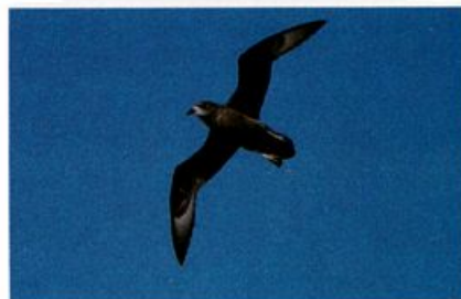
Top: The steep rise to the forehead, the wedge-shaped tail, and the chunky build are typical of the Murphy's Petrel. This bird has an extensively white throat and forehead, and the white intrudes well into the malar region. Transient light conditions make the underprimaries appear extensively white.