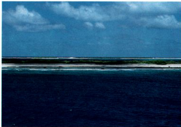
Ducie Atoll in November 1989.