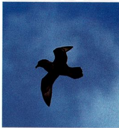
Murphy's Petrel engaged in "display" flight, Ducie Atoll, November 1989.

mottled whitish throats due to exposure of feathers which are basally white with thin sooty edges. The extent of the white or mottling on the throat varies considerably among birds, some individuals appearing to have almost solid white throats and others being nearly dark. Individuals with more extensively mottled throats typically show white intruding into the malar region. There is also considerable variation in the amount of white or mottling in the lores and above the bill, possibly resulting from differential wear. These feathers are basally dark with narrow whitish margins and should become darker with wear (Murphy 1949). Many birds have dark foreheads and lores, others are irregularly mottled with white in those areas, and still others are extensively white. The latter individuals appear to have a complete white band encircling the bill, a feature that can be obvious on flying birds at reasonably close distances. In spite of individual variation, the most extensively white area on a Murphy's Petrel is always the throat, a character first pointed out by Bailey et al. (1989). All individuals seem to have a dark smudge immediately anterior and posterior to the eye, a character that in the field can only be discerned at very close range. Below, Murphy's Petrels are evenly dark gray, although under some light conditions they may impart a dark-hooded look with a zone of contrast at the breast. Ac-