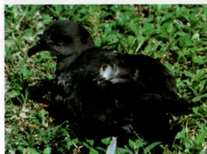
Captive Murphy's Petrel on Mangareva Island. This individual has relatively little white on the throat.

November 7, 1989 —One Murphy's Petrel and one intermediate-morph