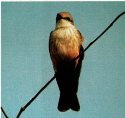
Furnishing a first state record, and only the third for the northeast, was this Vermilion Flycatcher at Jobs Corners, Tioga County, Pennsylvania, October 24-25, 1991.