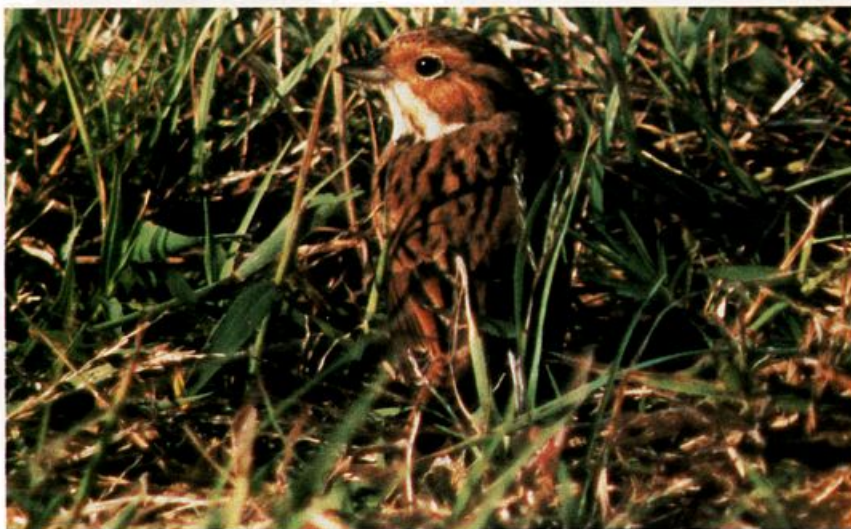
A Eurasian bird that had strayed as far as Alaska only three times, the Little Bunting was not on anyone's list of expected vagrants in California! But in the remarkable autumn of 1991, this individual on Point Loma in San Diego in late October barely stood out as the season's rarest bird.