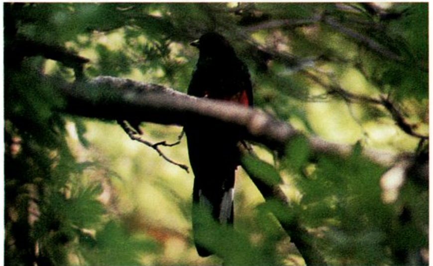
Fourteen years after its first known occurrence north of the border, the Eared Trogon was finally documented nesting in Arizona in October 1991. The nest was in upper Ramsey Canyon, Huachuca Mountains, where this wary male was studied in September.