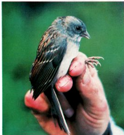
Although this hybrid combination has been found a number of times, it still can pose an identification problem for the birder who encounters it. This White-throated Sparrow X Dark-eyed Junco hybrid was banded at Cape May, New Jersey, in October 1991.