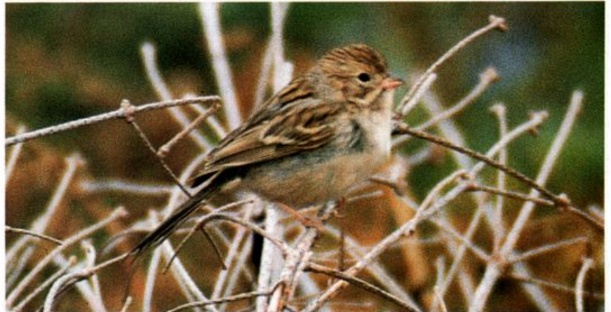
A subtle westerner that might be overlooked in the east at times, this Brewer's Sparrow at Harten's Point, Nova Scotia, on October 7, 1991, provided a first record for Atlantic Canada and one of very few for eastern North America.