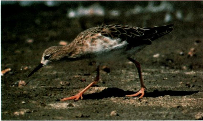
A Ruff at the Coyote Creek Riparian Station, Alviso, California, on October 4, 1991. One of four present at this location.