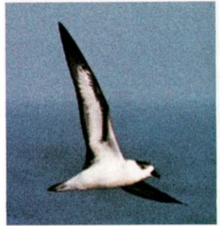
Difficult to photograph (like other Pterodroma petrels) and rare north of the Carolinas, Black-capped Petrel had never been fully documented off New Jersey before. Pelagic birding ace Alan Brady photographed this one over Hudson Canyon, 86 miles east of Barnegat Light, New Jersey, on September 16, 1991.