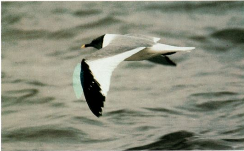
Most Sabine's Gulls found in the interior of the continent in fall are juveniles; but in autumn 1991, with Sabine's unusually numerous inland, several adults were found there as well. This one was in Scott County, Iowa, on October 14, 1991.