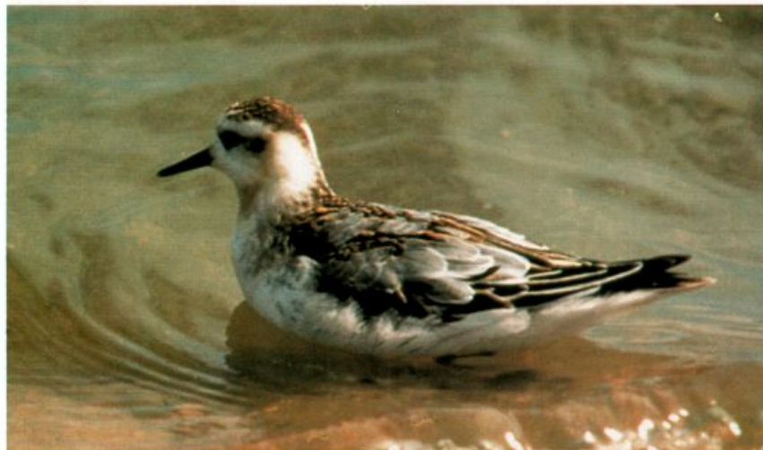
Some inland records of Red Phalaropes are to be expected every autumn, but this season they were far more numerous and more widespread than normal. This individual was at Saylorville Reservoir, Iowa, on September 27, 1991.