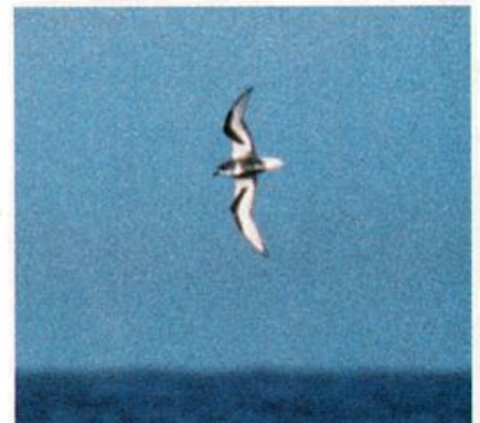
The waters far off northern California continue to turn up surprises. This Mottled Petrel was one of several found more than 70 miles to the southwest of Point Reyes on November 16, 1991. Against the white underparts, the bold black "boomerangs" by the wrists and the extensive dark gray belly are striking even at long distance.