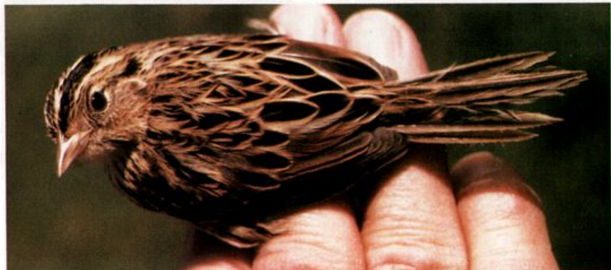
Migrant Le Conte's Sparrows are rarely detected in the Appalachian Region. This one was captured for banding at the Powdermill Nature Reserve, Pennsylvania, on October 20, 1991.