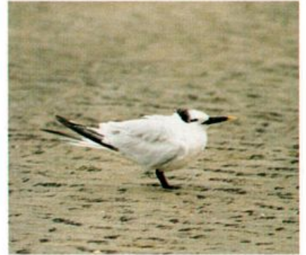
The most conspicuous avian result from Hurricane Bob , which swept north up the Atlantic Coast in late August, was a scattering of southern terns over the coastal areas of the northeast. This Sandwich Tern, one of three found in Maine, was at Phippsburg on August 20, 1991.