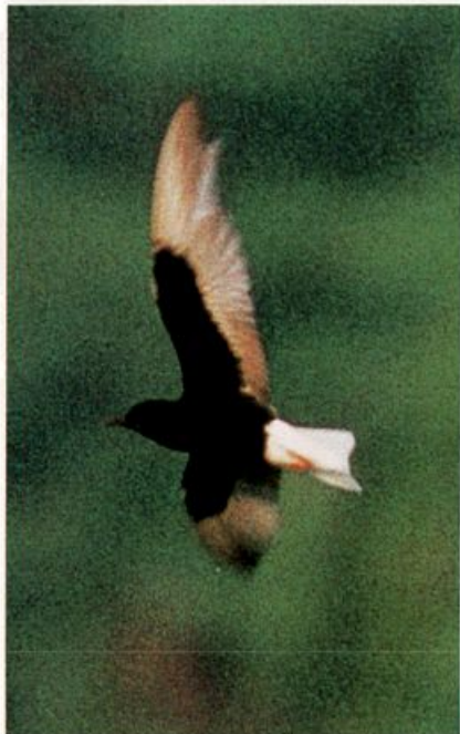
Adult White-winged Tern near Greece, New York, June 19, 1991. First fully documented state record, only a month after the first sight record (at the other end of the state, on Long Island). As this portrait shows, the species is "white-winged" only from the upperside.