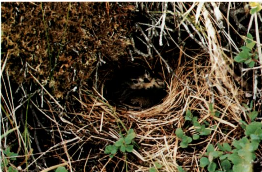
American Pipit incubating eggs in a nest on Mount Washington, New Hampshire, June 29, 1991. A new nesting location for the species, and the southernmost known in eastern North America.