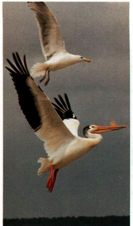
This wandering American White Pelican was seen on most of Virginia's coastal islands during this summer. It was photographed June 18, 1991, at a sandbar between Cedar and Metompkin islands, Virginia.