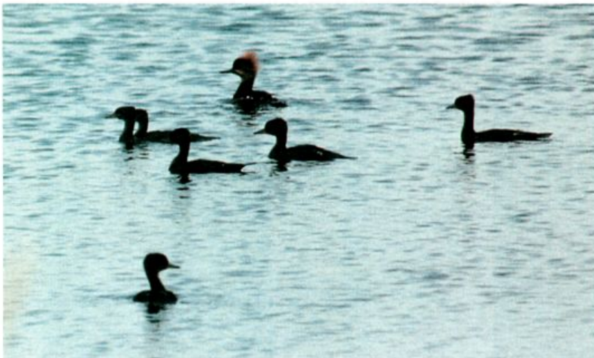
Female Hooded Merganser (back) with a group of her young at Des Plaines Conservation Area, Will County, Illinois, June 15, 1991. The species is a rare breeder in this area.