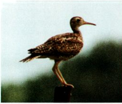
Upland Sandpiper on territory at the Joliet Arsenal, Will County, Illinois, on June 21, 1991. Such places can provide essential habitat for beleaguered wildlife; the Arsenal hosts the largest population of Upland Sandpipers in Illinois.