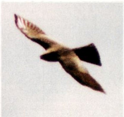
Adult Mississippi Kite in Greensville County, Virginia, near the North Carolina border, June 6, 1991. One of two adults present at this site.