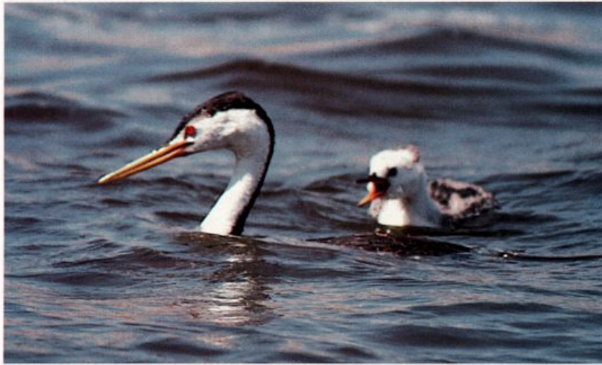
Adult Clark's Grebe with downy young at Lake Traverse, on the Minnesota/South Dakota border, summer 1991. First nesting record for Minnesota.