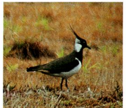
"The most obliging lapwing in recent history" was this male Northern Lapwing that spent the whole summer of 1991 near Aulac, New Brunswick. Most North American appearances of this Eurasian plover have been very brief.