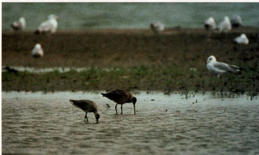
Marbled Godwit and Willet together at Presque Isle State Park, Pennsylvania, July 7, 1991. Both species are rare in Pennsylvania, but perhaps more likely at Presque Isle than anywhere else in the state.