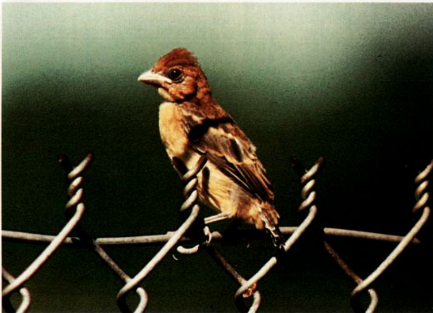
Blue Grosbeaks are continuing to expand at the northern edges of their range. This recently fledged juvenile was found in western Will County, Illinois, on August 13, 1991.