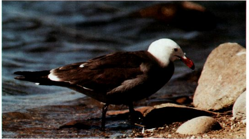
This adult Heermann's Gull turned up far from its usual coastal haunts at Paradise Pond, Reno, Nevada, on June 3, 1991.