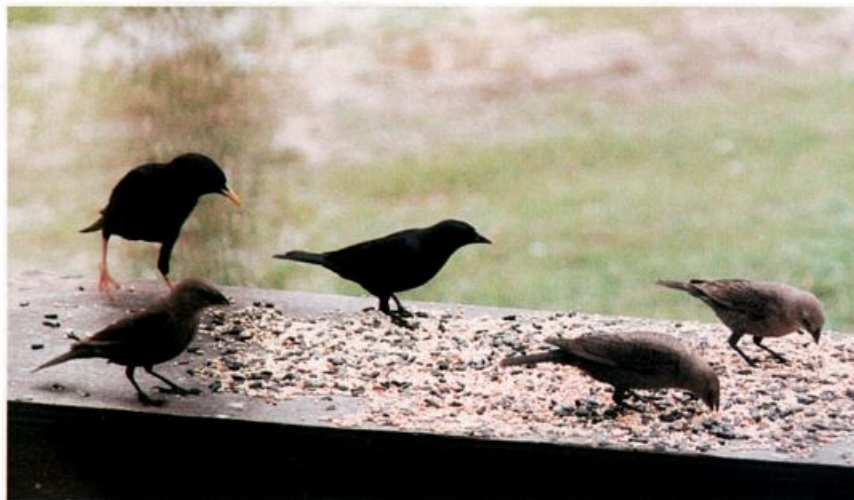
Providing a first state record was this male Shiny Cowbird (back center) associating with three female cowbirds (apparently Brown-headed) and one male European Starling at Waveland, Mississippi, June 12, 1991.