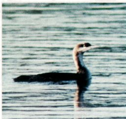
Pacific Loon in first-summer plumage on Sun Lake, Lake County, Illinois, June 24, 1991. An exceptional summer record for the Midwest.