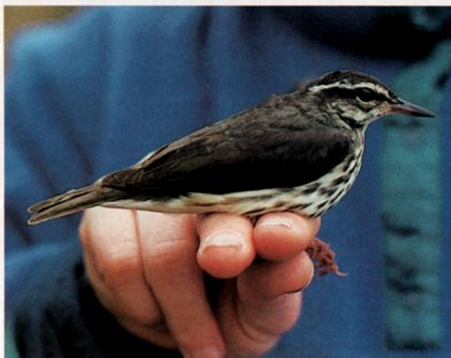
Two from the Farallones: on California's Southeast Farallon Island, where very few birds pass unscrutinized, the best "spring" birding may occur in June. Golden-winged Warbler (left), photographed there June 3, 1991, is among the rarest of eastern warblers in the West at any season. Louisiana Waterthrush (right), photographed there June 2, 1991, is even more of a rarity in California; it had been found only three times previously in the state.